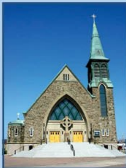
Saint Augustine's Moncton