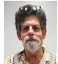
Snack King Avilicious