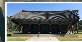
GYEONGSANGBUK-DO 5 (PENTA) MOUNDS