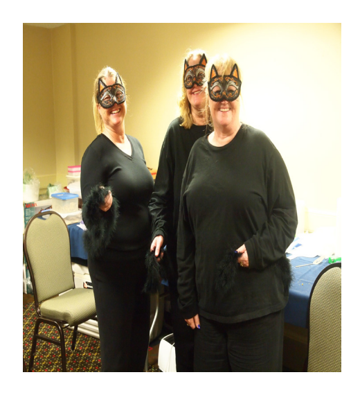
Costumes from the Halloween party in 2013.