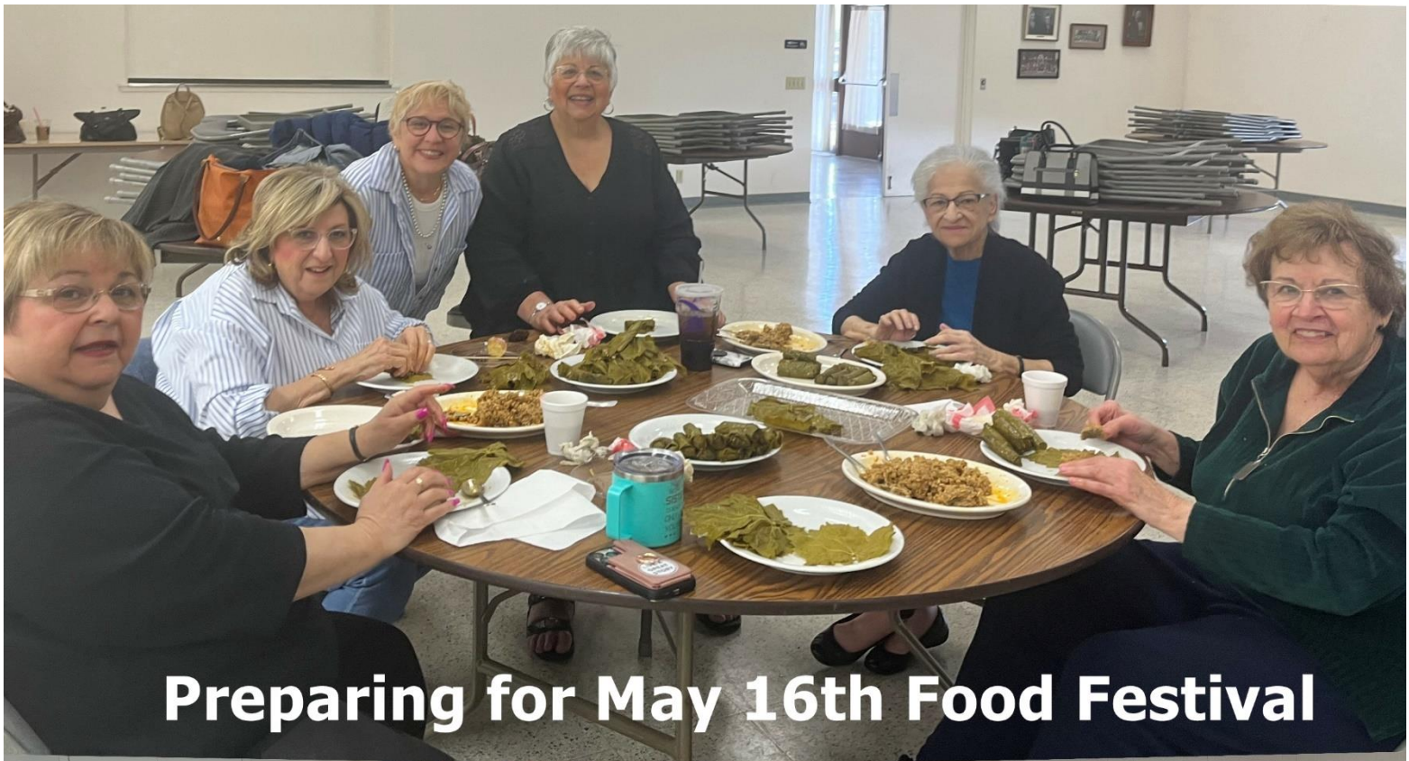
Preparing for May 16th Food Festival