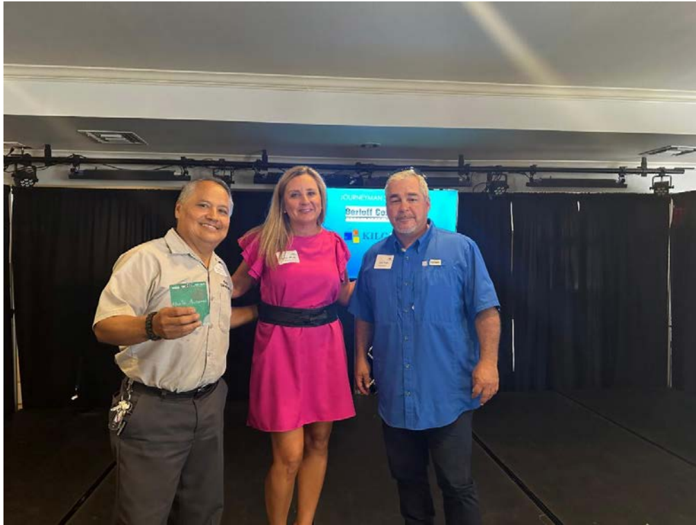
Winners from last contest