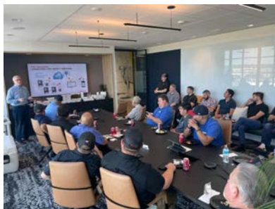
Honeywell Fire Alarm Class