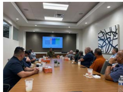
Trane Next Gen Refrigerant Class