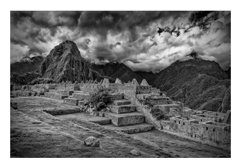
Deserted, But for the Souls - 27 Dan Tonisson