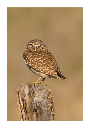
Hello There - 27 Cheryl Callen