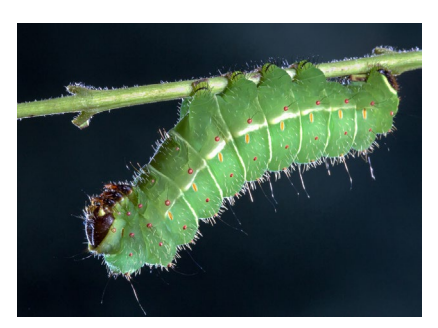
Luna Moth Caterpillar - 27 Linda Avitt