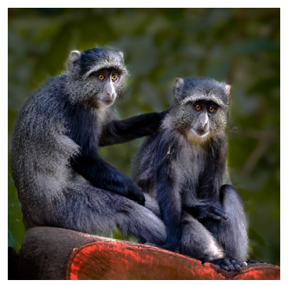
Sad Eyes - 27 Linda Sheppard