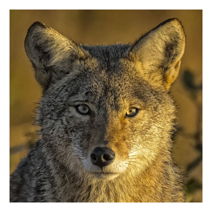
My, What Big Eyes - 27 Paul Munch