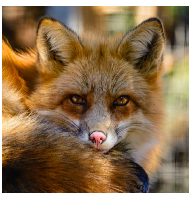
Red Fox (Captive) - 27 Dolph McCranie