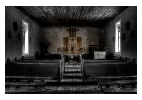
Terlingua Church - 27 Phil Charlton