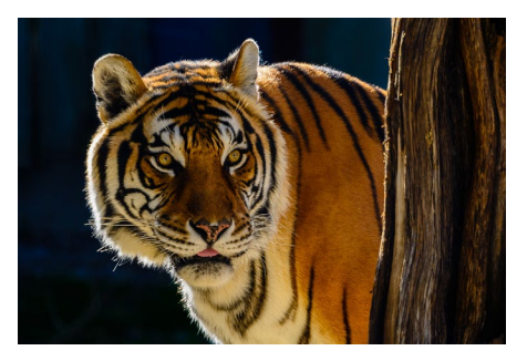
Bengal Tiger (Captive) - 27 Dolph McCranie