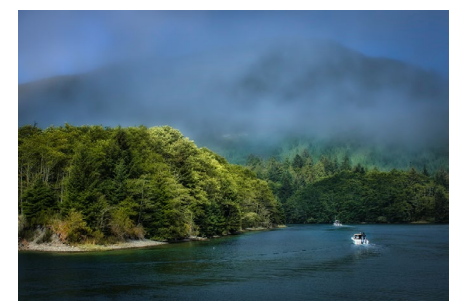
Into the Fog - 27 Rose Epps