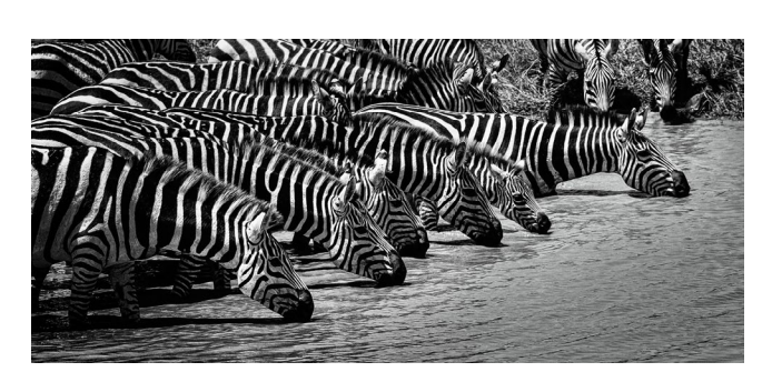
At the Waterhole - 27 Linda Sheppard