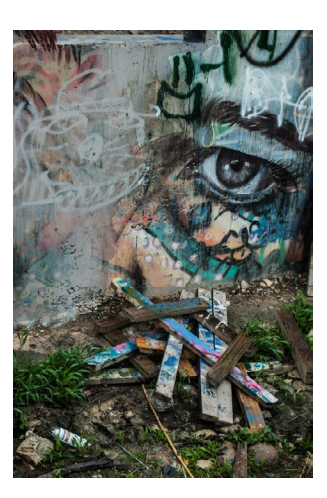
Austin Graffiti - 27 Sheri Favela