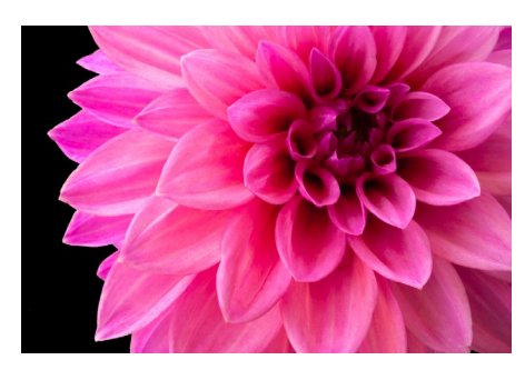
Full Bloom - 27 Ken Uplinger