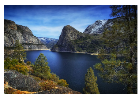
Bliss - 26 Cheryl Callen