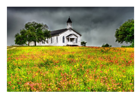
Cheapside Church - 27 Phil Charlton