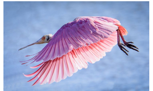
Roseatte Spoonbill - 27 Dolph McCranie