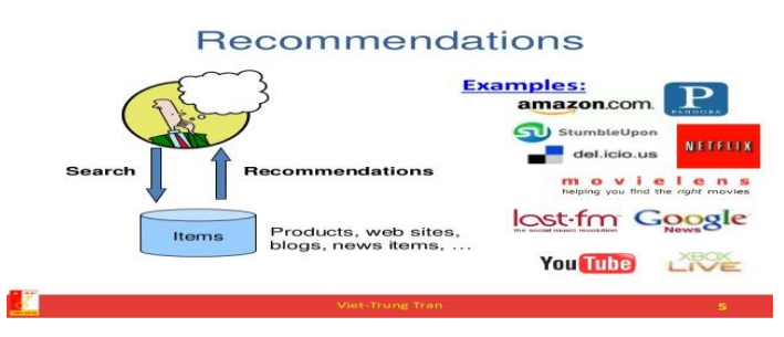
Fig.1.2. Recommendation system

The following figure is a general model of recommendation which summarizes the recommendation process by identifying the communication among its components.