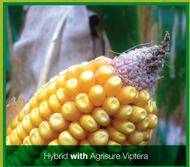
Hybrid with Agrisure Viptera

The spores of fungi responsible for aflatoxin enter corn plants through exposed areas such as those caused by insect damage and spread the harmful toxin throughout the corn plant.