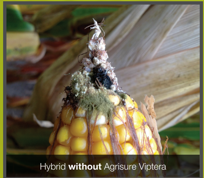
Hybrid without Agrisure Viptera

The spores of fungi responsible for aflatoxin enter corn plants through exposed areas such as those caused by insect damage and spread the harmful toxin throughout the corn plant.