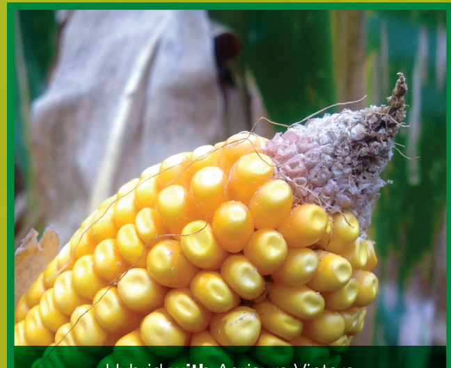
Hybrid with Agrisure Viptera

The spores of fungi responsible for aflatoxin enter corn plants through exposed areas such as those caused by insect damage and spread the harmful toxin throughout the corn plant.