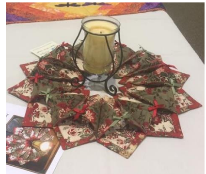
1 Fold & Stitch Wreath , Linda Whitford