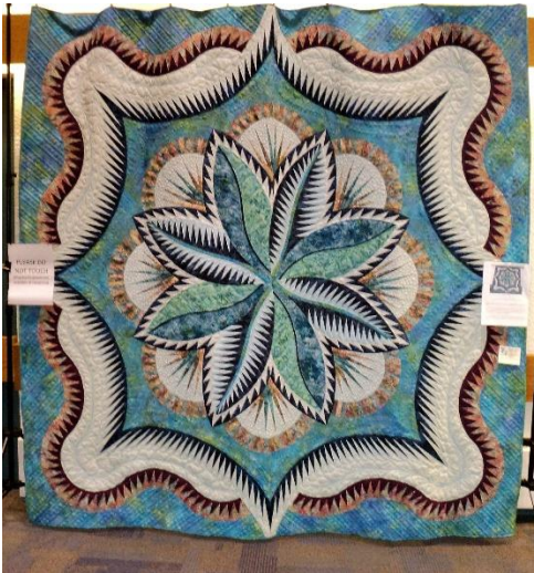
1 Fire Island Hosta , Linda Whitford