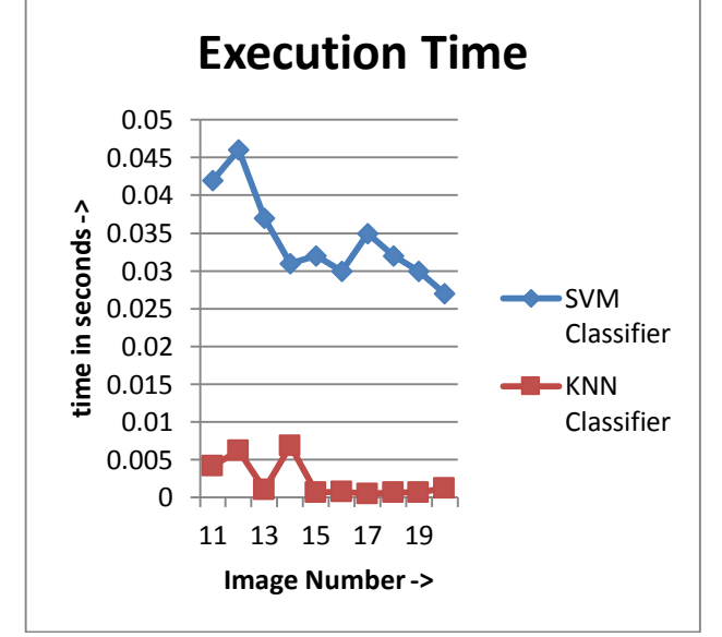
Fig.2: Execution Time

The proposed work is implemented in MATLAB and the simulations are performed to evaluate its performance.