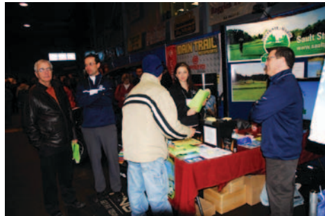
Recruiting new members