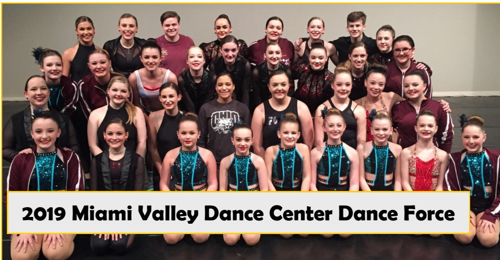
2019 Miami Valley Dance Center Dance Force

The Miami Valley Dance Center Dance Force began the 2019 competition season March 1-3. Please see the calendar on page 1 for all the competition dates. Plan to come out and support your team. Admission is always free! Here's wishing the Dance Force the best possible season!