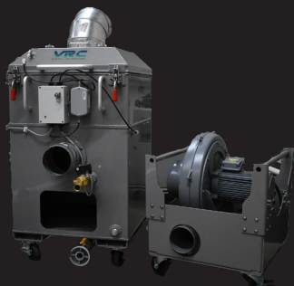
VRC's Portable Dust Collector