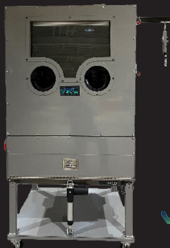
VRC's Custom Glove Box