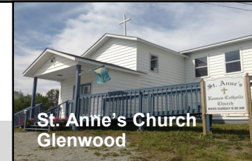
St. Anne's Church Glenwood

Check out our bulletin on-line at http://www.stjosephsparishgander.ca