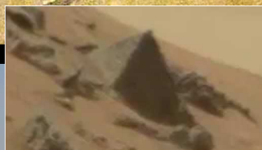
Photograph of apparent pyramid on Mars by Rover

Perhaps those that were in the proximity of Earth are the ones that forsook their estate and came down during the days of Enoch at Mt. Hermon. This also goes along the Biblical narrative that there has been war in the Heavens due to Lucifer's rebellion and perhaps the wreckage of planets as seen by the evidence of surface bombardments across the Solar System speaks of this Luciferian Angelic War that scared the planet Mars for example. Since the Flood, these same Fallen Angel entities have been waiting for Humanity to catch up to the technology so they can pick up where they left off sort of speak. It has only been in the last few decades that the technological sophistication now exist to do what was done as in the Days of Noah.