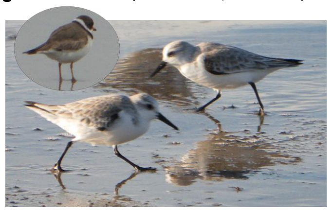
Plovers and Sandpipers (Sanderlings foreground, Semipalmated plover inset)