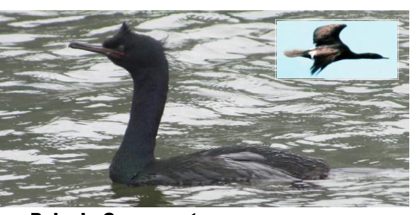
Pelagic Cormorant (snake-like neck, dives for fish)