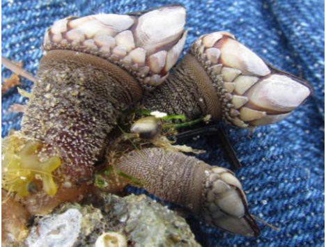
Pelagic Goose-neck Barnacle (both attached to flotsam) Pacific Goose Barnacle