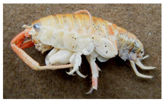
California Beach Hopper (feeds on beach)