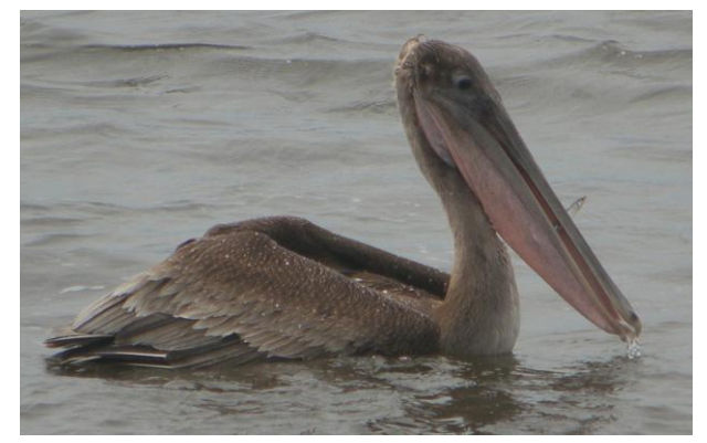
Brown Pelican (with Sand Lance in mouth)