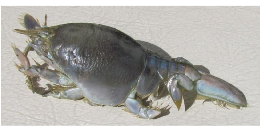
Pacific Mole Crab (borrows and feeds on beach)