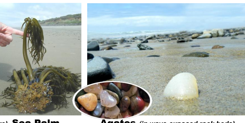
Bull Kelp (seaweeds are washed up from offshore) Sea Palm