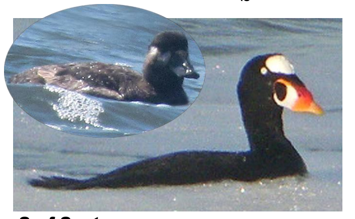
Surf Scoter (female & colorful male, flocks, divers)