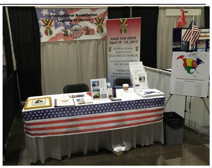
International Legions of Honor Booth at Imperial Session 2016

The IALOH newsletter is to be published periodically as a way to "pass the word" and get applications/forms to the membership. Distribution is to all Legion of Honor Units and to individual subscribers at the rate of $10.00 per year. A free, on-line version is available for download from the IALOH web site, http:://www.ialoh.org. If you would like to receive a printed edition of the newsletter, please contact the International Adjutant.