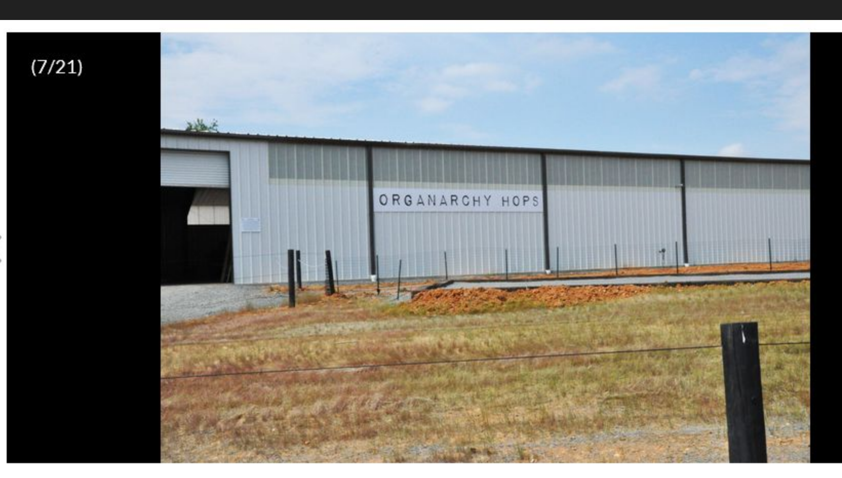
Staples planted five acres of hops and built a hops-processing facility on his new farm. It just so happens it's also the largest processing plant in the