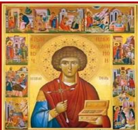
Gr. Martyr and Healer St.