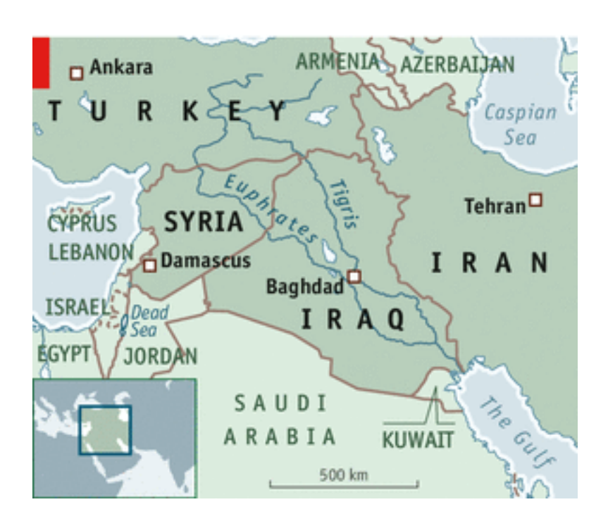
Figure 1 Map of the Tigris and Euphrates Water Basin

In the ambition of resolving armed conflicts in the middle east, the international community, as well as international organizations and media publications, have focused on trying to find the cause to certain issues. While it is certain that many conflicts in the Middle East such as the Syrian Civil War (2012-present) and the Yemeni Civil War (2015-present) were catalysed after the Arab Spring of 2011, experts suggest that governmental mismanagement of water access (mainly being a side effect to lack of diplomacy and interdependence in the region) have led to these issues. With this, the Tigris and Euphrates Water Basin remains as one of the largest water reserves for the likes of the Turkey, Syria, Iraq, and Iran, especially to non-coastal cities in each country. With this, it is said that rural populations moved to coastal and urban city centers, setting the stage of a number of conflicts.