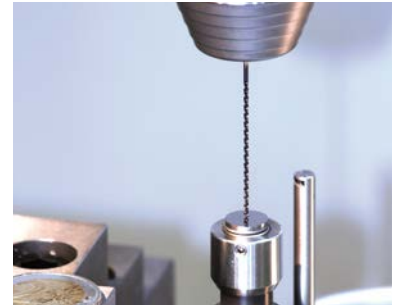
Fast tool breakage detection