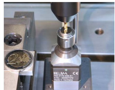
Tool length measurement