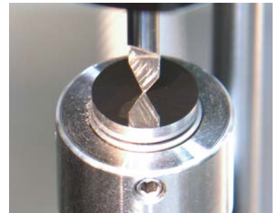
Extremely low measuring force enables the measurement of most sensitive tools