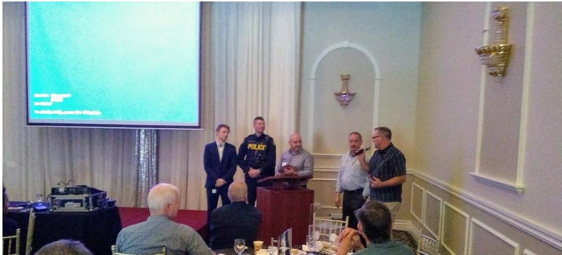
Scene from our 'Cannabis & Trucking' meeting on October 13 th