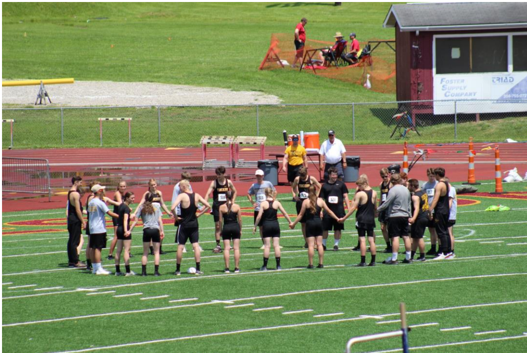
The Tucker County Track Team gathered together in a circle of Prayer before the State Track Meet on May 17th in Charleston