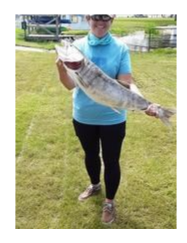
O-Fish-L Business -17.70# Lake Trout - 8/2/20