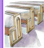
News from the Pews

If you own a canopy - the church would like to borrow it for the event day.