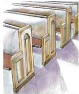
News from the Pews