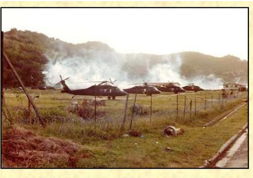
U. S. Army Blackhawk helicopters on Grenada

Bishop was eventually murdered in October of 1983 during a power struggle with hard-liners in his own movement, creating a breakdown in civil order that threatened the lives of American medical students who were living on the island. In response, and at the request of allied Caribbean nations, the US launched "Operation Urgent Fury," sending the Marines to the north of the island and Army Rangers to the south.