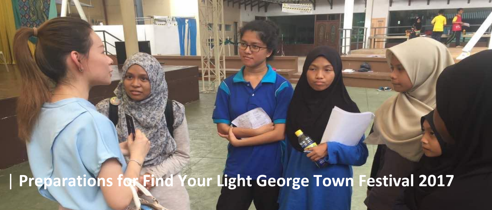
| Preparations for Find Your Light George Town Festival 2017