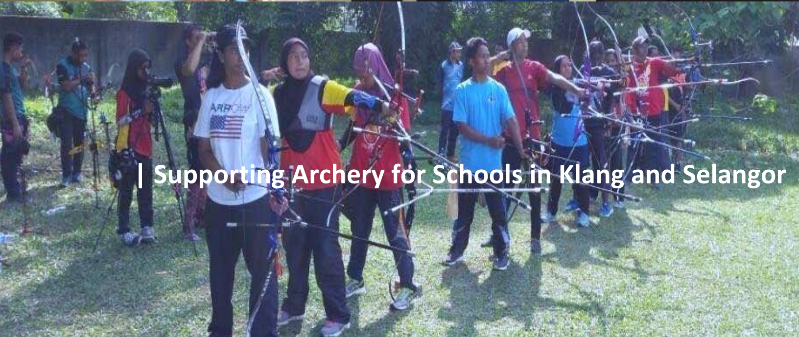
| Supporting Archery for Schools in Klang and Selangor