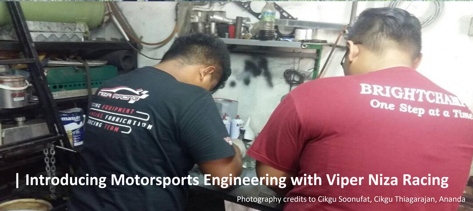
| Introducing Motorsports Engineering with Viper Niza Racing