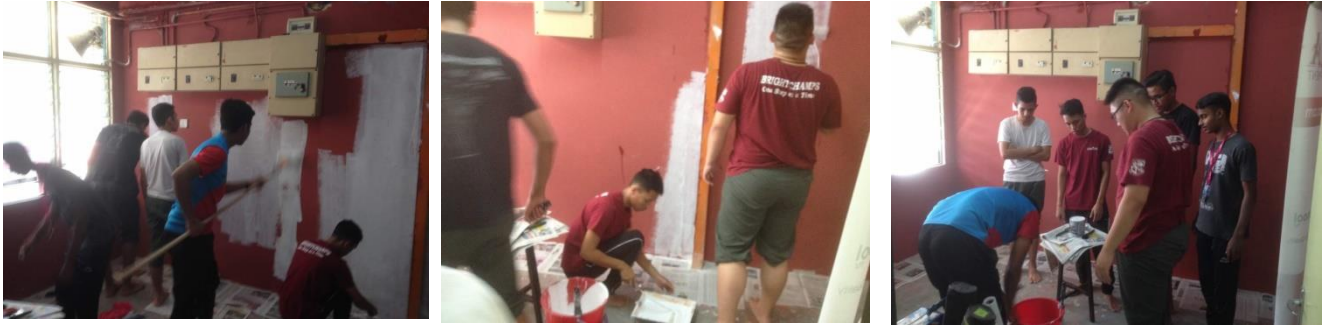
SASTRA Bright Champs supporting to clear some space for new technology room.