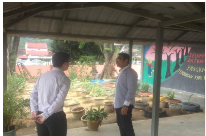
Social Impact Investors visiting SMK Taman Ehsan, Selangor to support on “Project Growing Green 2018” at SMK Taman Ehsan guided by form six students during their internship with SASTRA.