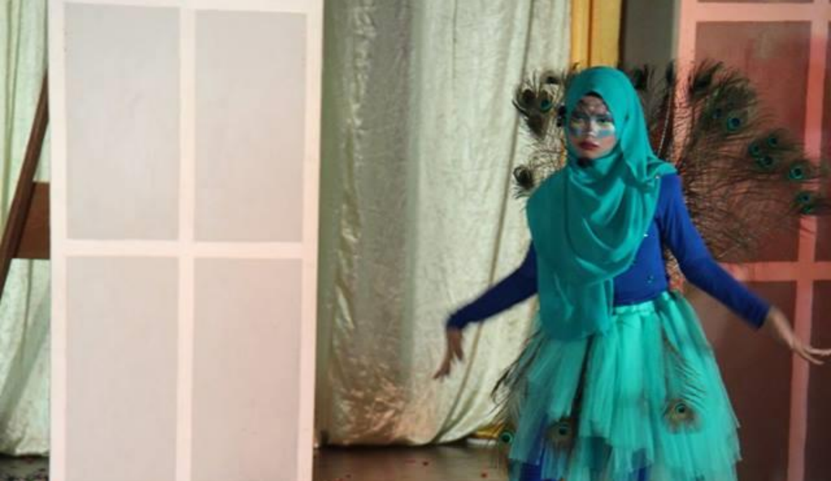
OPENING NIGHT "FIND YOUR LIGHT 2017"— A Performing Arts Project by School Children from State of Kedah.