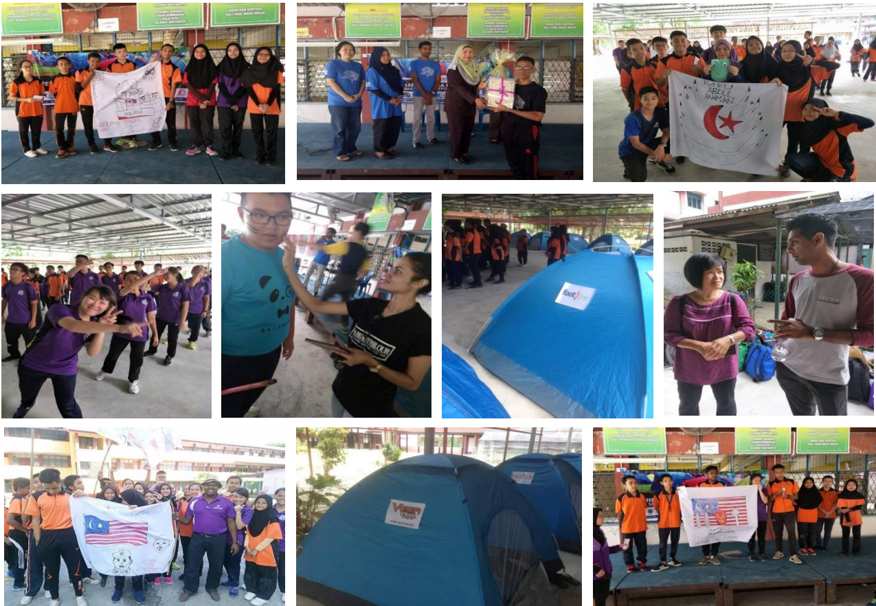
Various collective programs were carried out at the RIMUP Program. SASTRA provided new camping tents for school and also support provided by IT Stream Technology and Zara Artistic during the program.