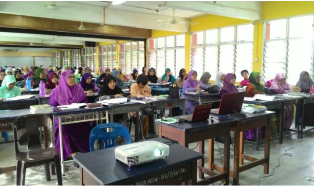
SASTRA OSH In School pilot project was Initiated in September 2016 at SMK Taman Ehsan to support and deliver the National Institute of Occupational Safety and Health (NIOSH) and Ministry of Education Malaysia (MOE) aim to make schools a safer place for every stakeholders. In February 2017, SASTRA "handed over" the project after initiating it to a private company to further develop and support SMK Taman Ehsan and other national schools in Malaysia.

"SASTRA team, keep up your good work and deeds as always. May god bless and support all your initiatives. Go go go Sastra!"