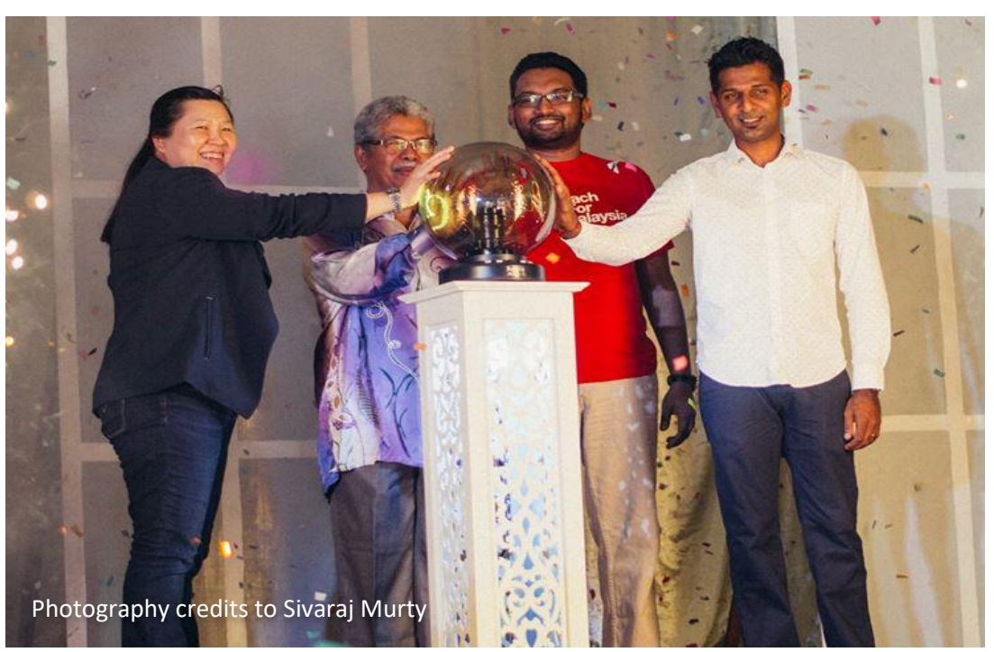
Official Launch Find Your Light at George Town Festival Penang 2017