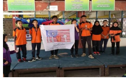
Various collective programs were carried out at the RIMUP Program. SASTRA provided new camping tents for school and also support provided by IT Stream Technology and Zara Artistic during the program.