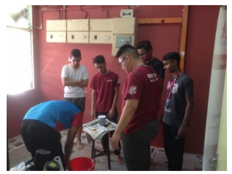
SASTRA Bright Champs supporting to clear some space for new technology room.