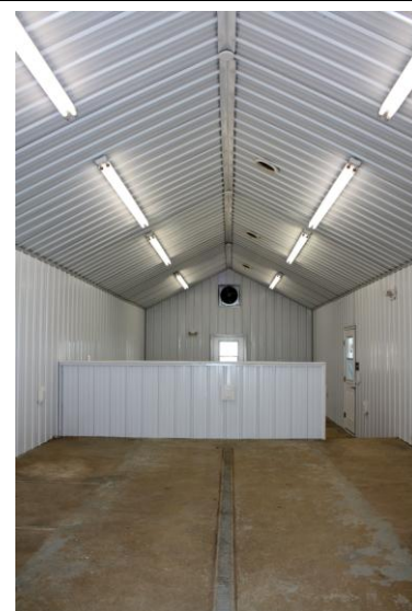
The renovated lower nursery.

There are also wheel chair accessible parking pads with access to both the upper and lower nurseries.