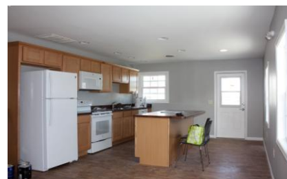
The newly renovated kitchen.

There are also wheel chair accessible parking pads with access to both the upper and lower nurseries.