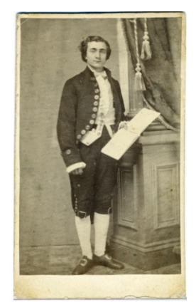
A Colonial Magistrate

By the end of July the delegates begin to sense that what they set out to do back in May might actually be within their reach. A whole new government, respectful of each state's sovereignty, but bound together by a central authority dedicated to the common good for all.