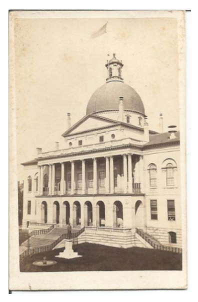
On October 27, 1787, Congress submits the Constitution to the States for ratification.

The bar for acceptance has been set at nine states, but no one is particularly comfortable about "imposing" the contract on holdouts. The unanimity Franklin lobbied for is deemed essential.