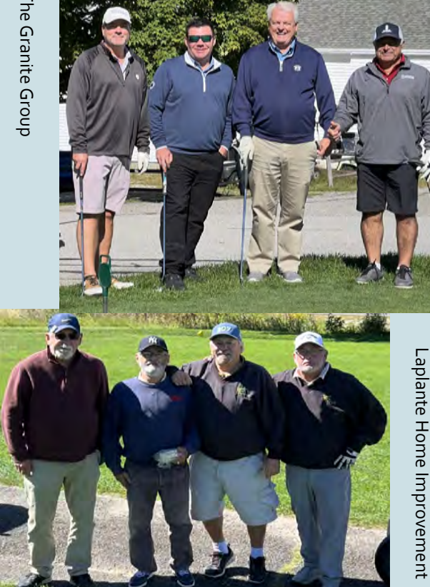
Sunco Pump & Well Drilling