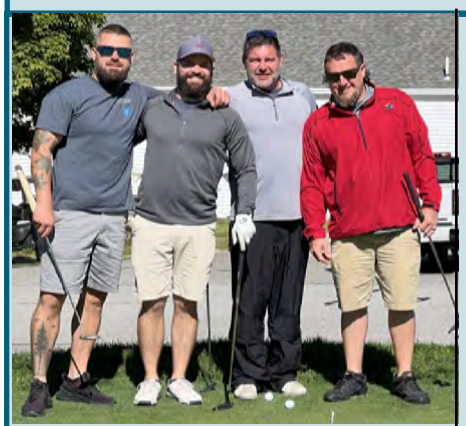
Cross Well & Pump