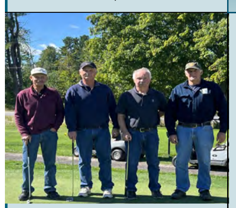
Hillock & Hansen's Well Drilling