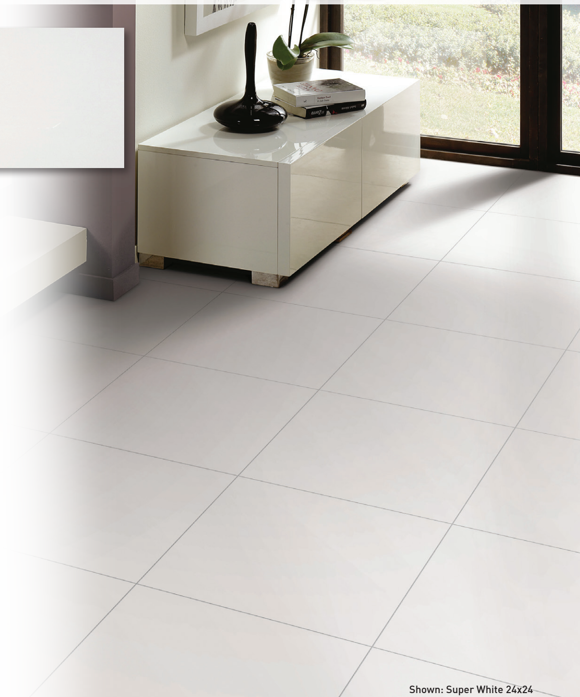
Shown: Super White 24x24