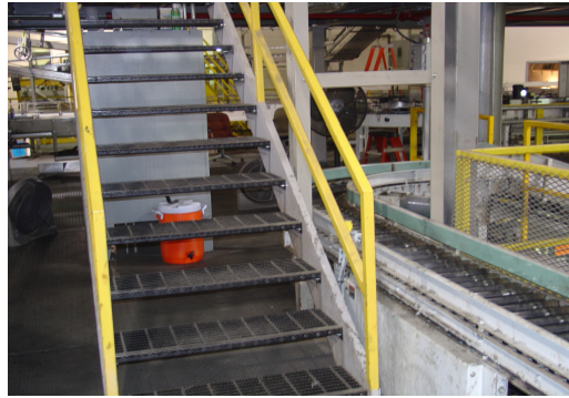
Second Level above bottling floor - all YELLOW railings wiped down, floor cleaned - Every Two Months