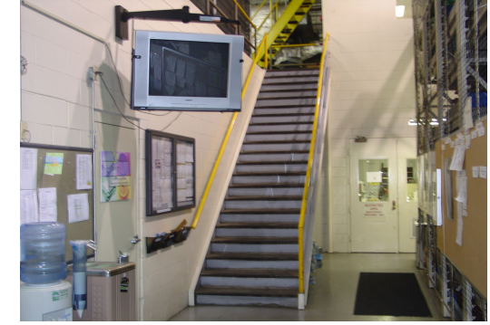
Scrub steps, platform, railings, etc leading to break area Monthly