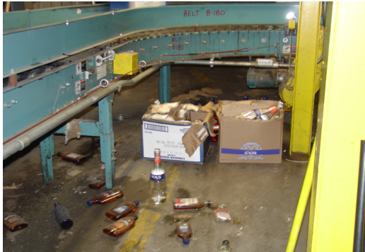
All bottles disposed of in Shipping tunnel to Shipping Two Bi-Monthly