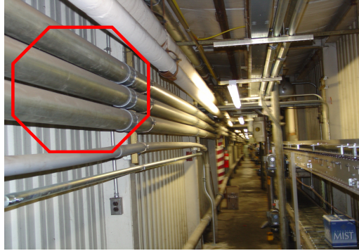
Wipe down piping leading to Shipping