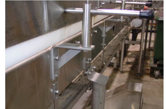
Drips pans are to be cleaned Monthly