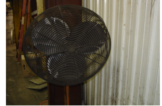
All Fans cleaned and wiped down Every Two Months