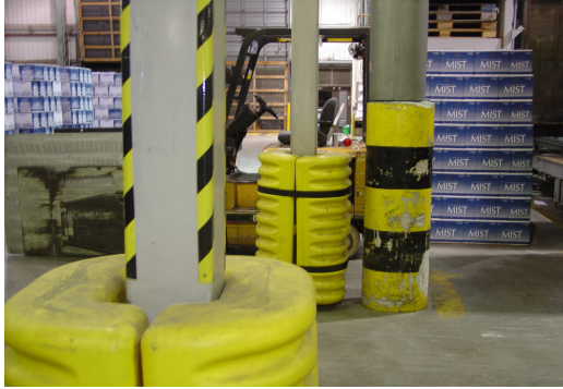
Plant-wide, yellow protectors should be wipe down - free of dirt and dust Monthly