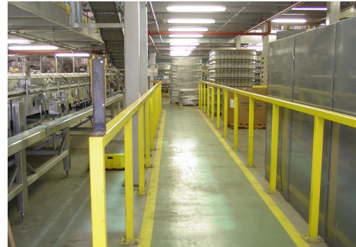
Run floor scrubber around green mile Weekly