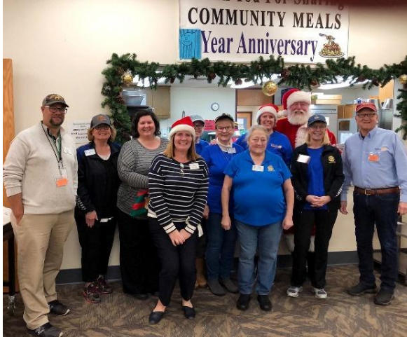
Community Meal Volunteers