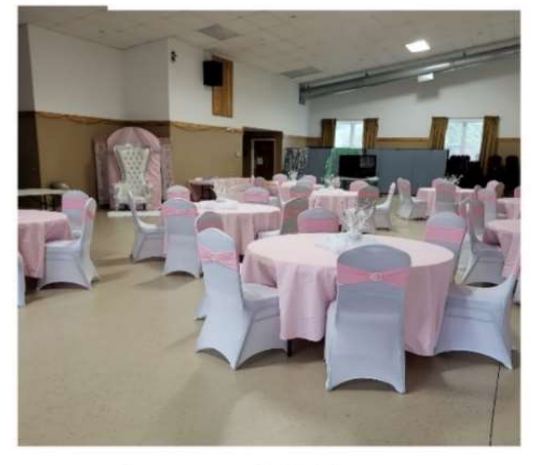
Sweet 16 Party