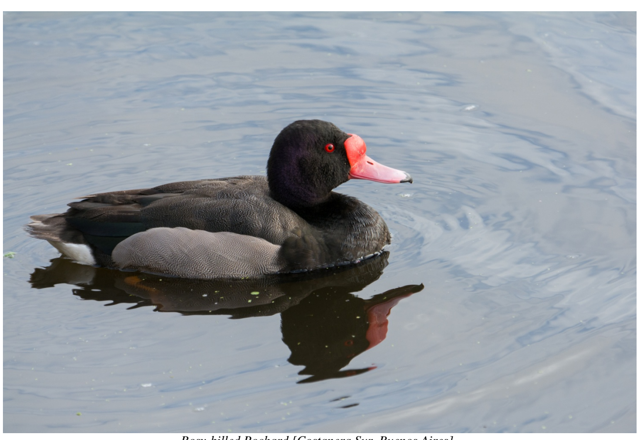
Rosy-billed Pochard [Costanera Sur, Buenos Aires]