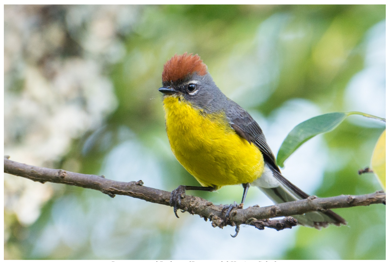
Brown-capped Redstart [Reserva del Huaico, Salta]