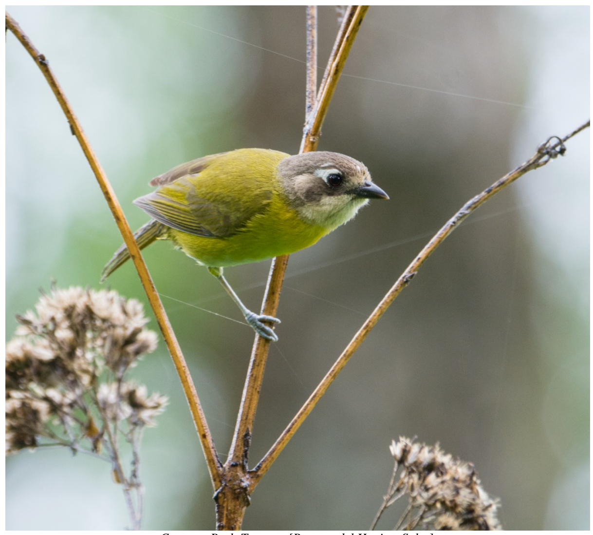
Common Bush-Tanager [Reserva del Huaico, Salta]