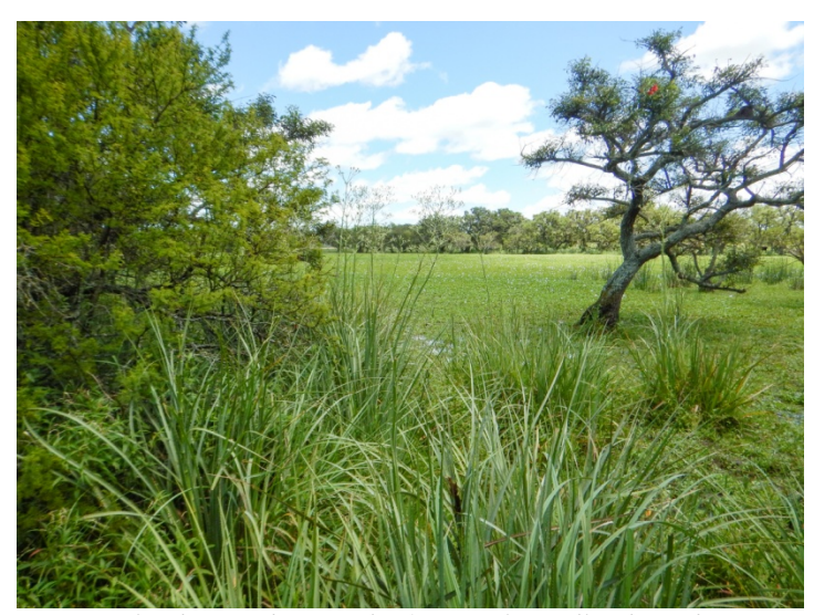
View across a wetland towards a patch of Espinal woodland [Ceibas, Entre Ríos]