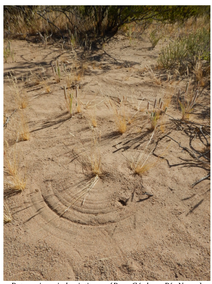
Patagonian wind paintings... [Paso Córdova, Río Negro]