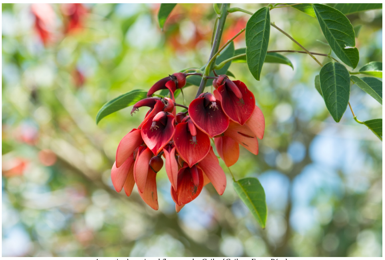
Argentina's national flower – the Ceibo [Ceibas, Entre Ríos]