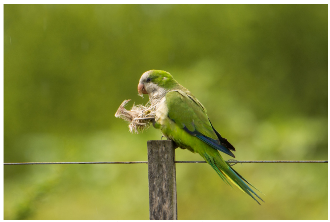
Monk Parakeet eating a cactus flower [Ceibas, Entre Ríos]