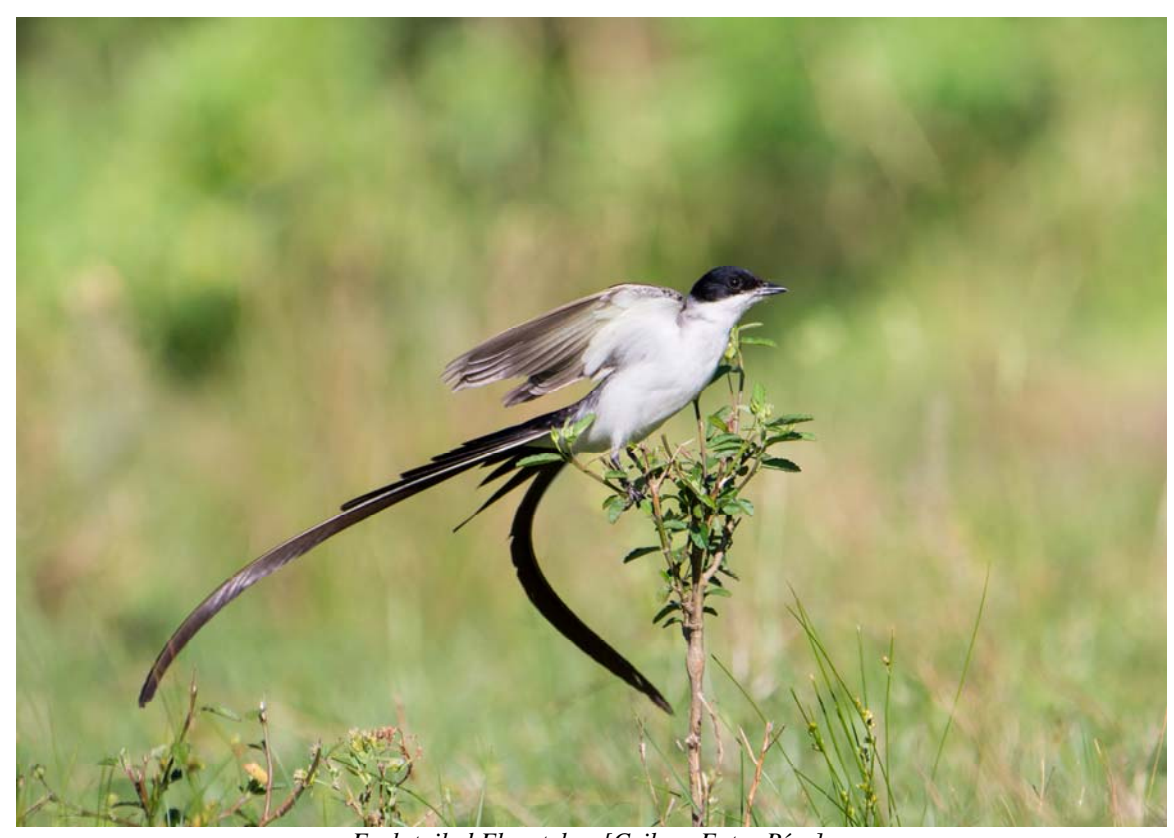
Fork-tailed Flycatcher [Ceibas, Entre Ríos]