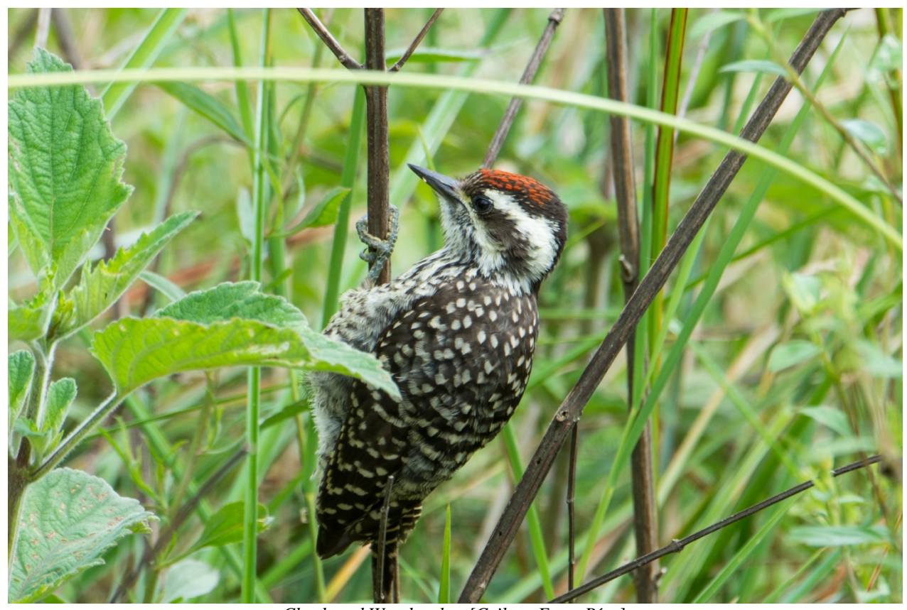
Checkered Woodpecker [Ceibas, Entre Ríos]