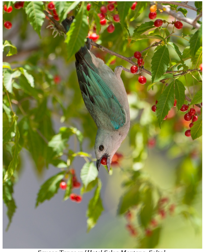
Sayaca Tanager [Hotel Selva Montana, Salta]