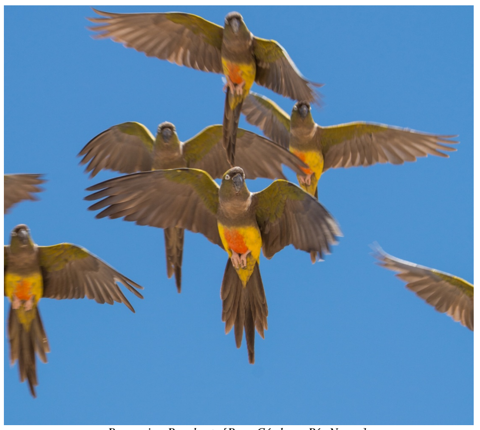
Burrowing Parakeets [Paso Córdova, Río Negro]

I also organized my first ever trips away from Buenos Aires, spending weekends in three other provinces – Río Negro (in northern Patagonia), Salta (in the northwest), and Entre Ríos (just to the north of Buenos Aires, between the Río Paraná and Río Uruguay).