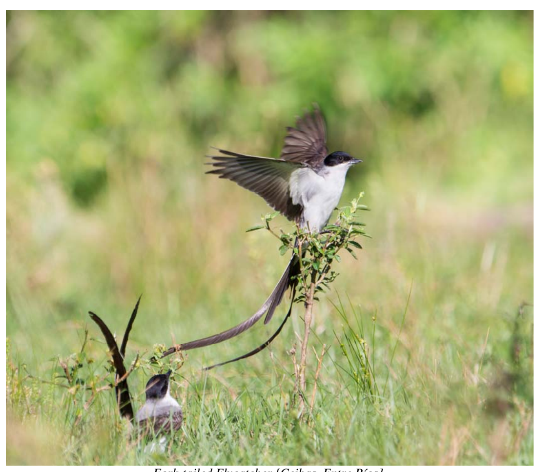
Fork-tailed Flycatcher [Ceibas, Entre Ríos]