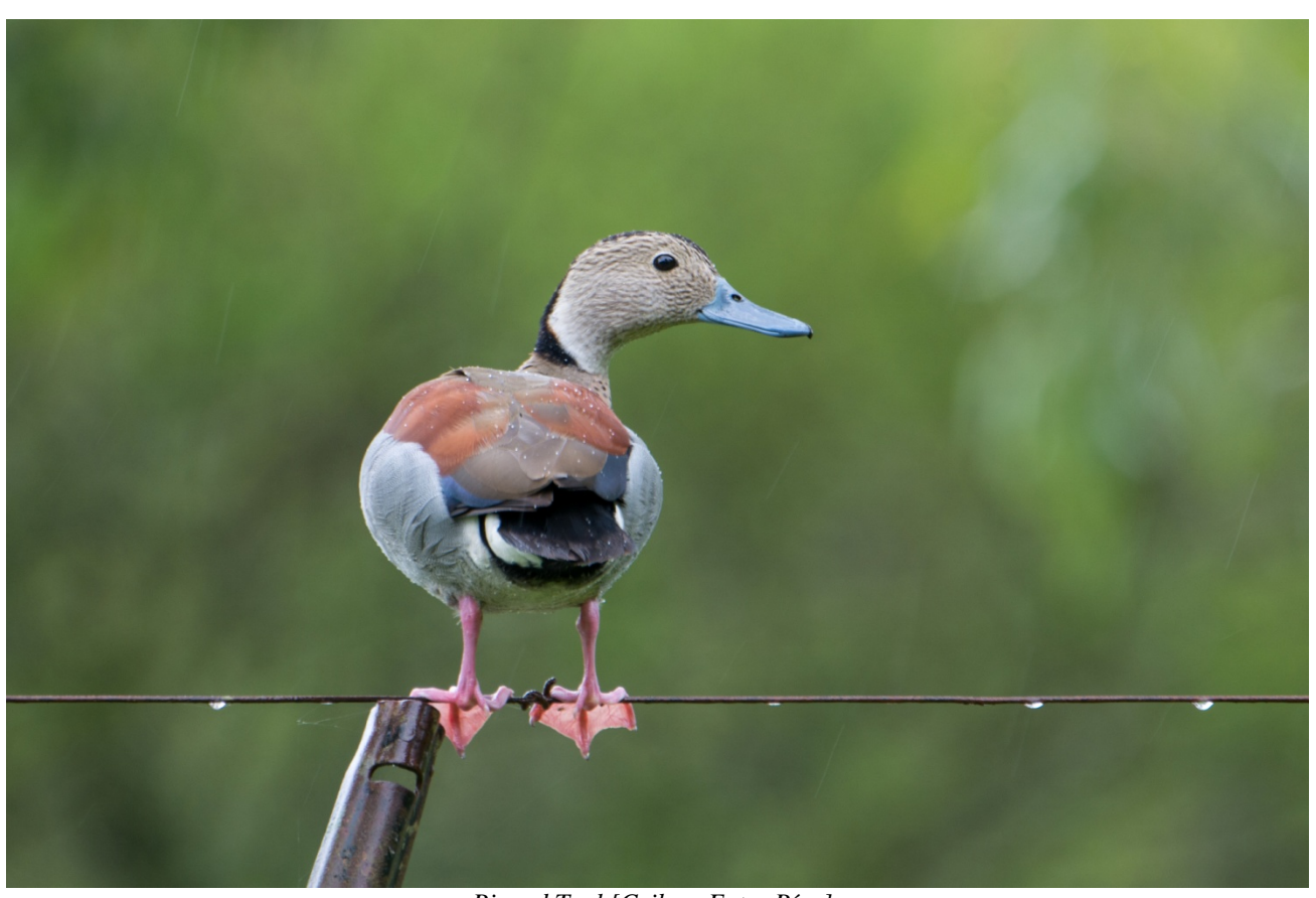
Ringed Teal [Ceibas, Entre Ríos]