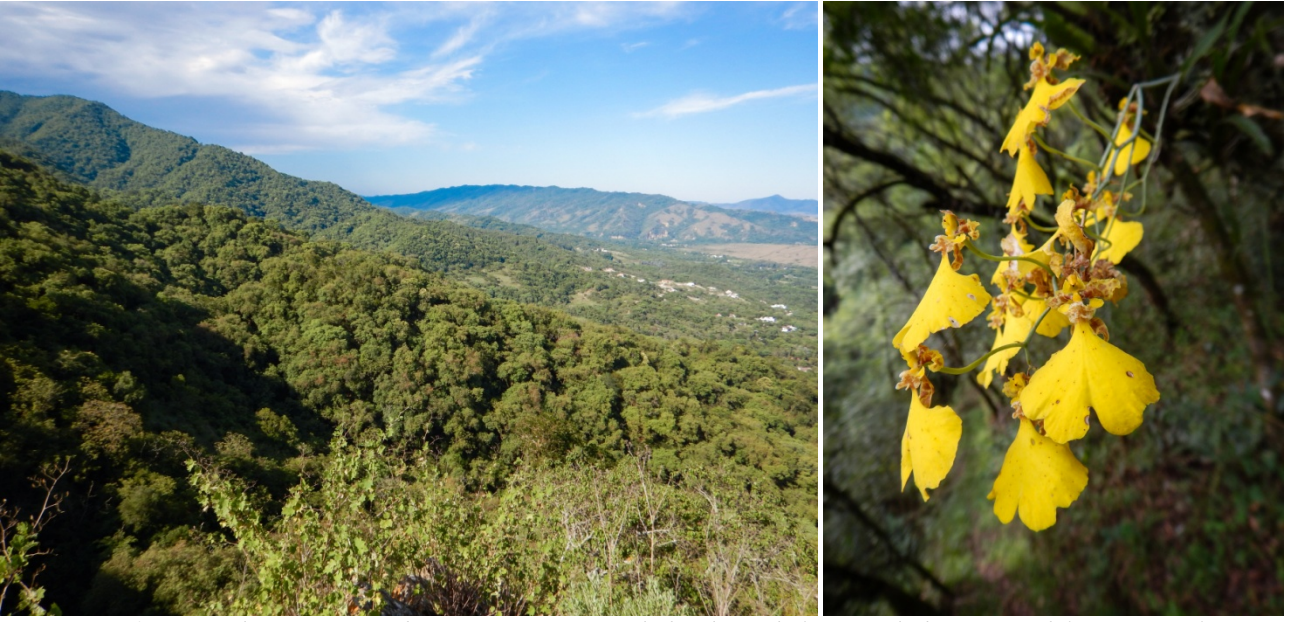
Yungas forest on the mountains above San Lorenzo, with dry desert below; Orchid [Reserva del Huaico, Salta]