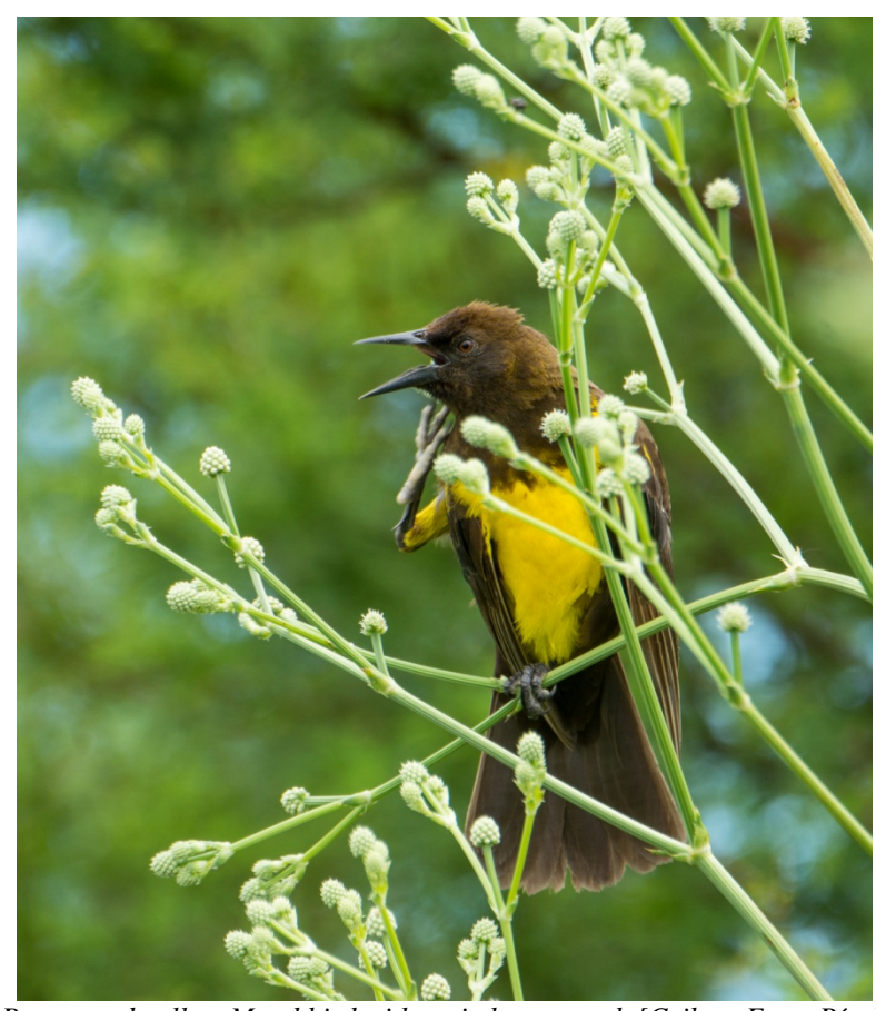
Brown-and-yellow Marshbird with an itch to scratch [Ceibas, Entre Ríos]