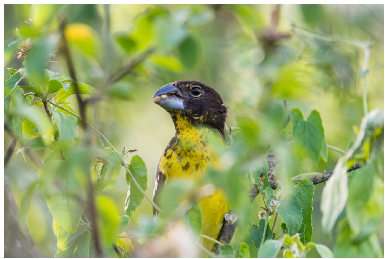
Black-backed Grosbeak [Reserva del Huaico, Salta]