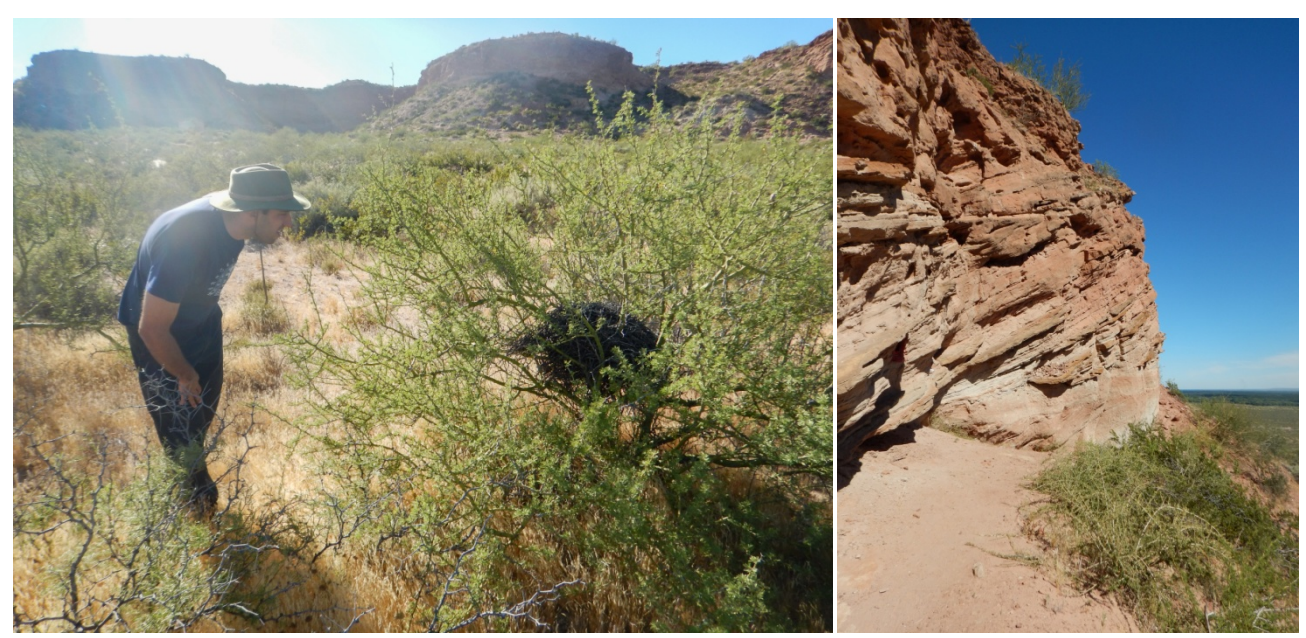
Jaime inspecting an old White-throated Cacholote nest in a chañar; A barda [Paso Córdova, Río Negro]