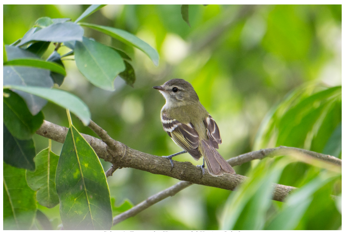
Sclater's Tyrannulet [Reserva del Huaico, Salta]