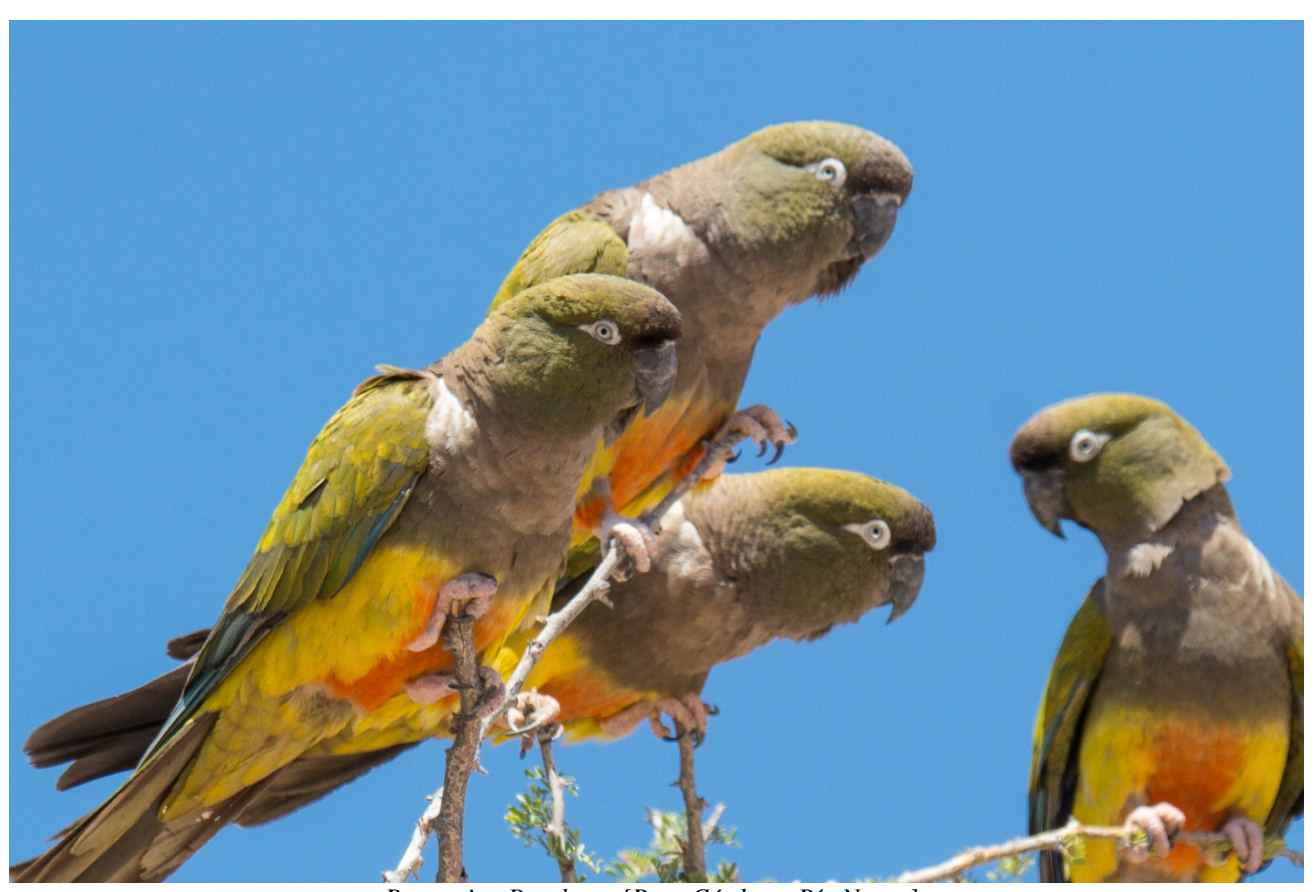
Burrowing Parakeets [Paso Córdova, Río Negro]