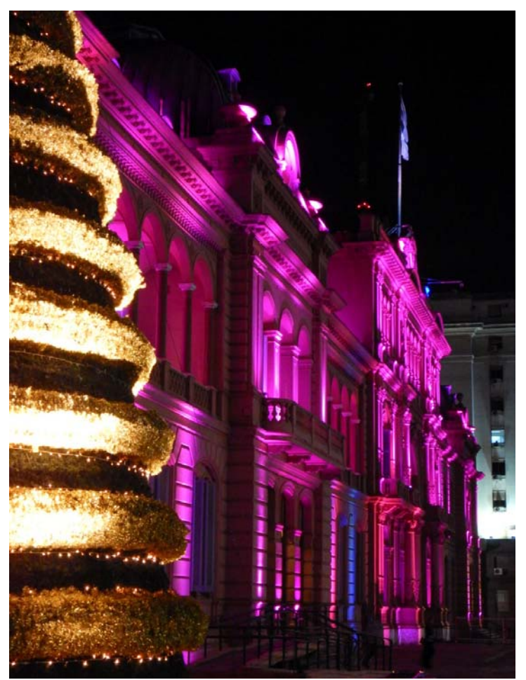
Christmas tree outside the Casa Rosada presidential palace [Plaza de Mayo, Buenos Aires]