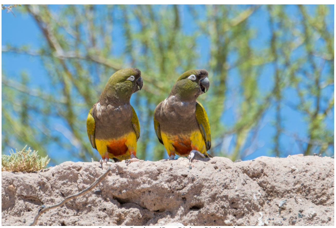
Burrowing Parakeets [Paso Córdova, Río Negro]