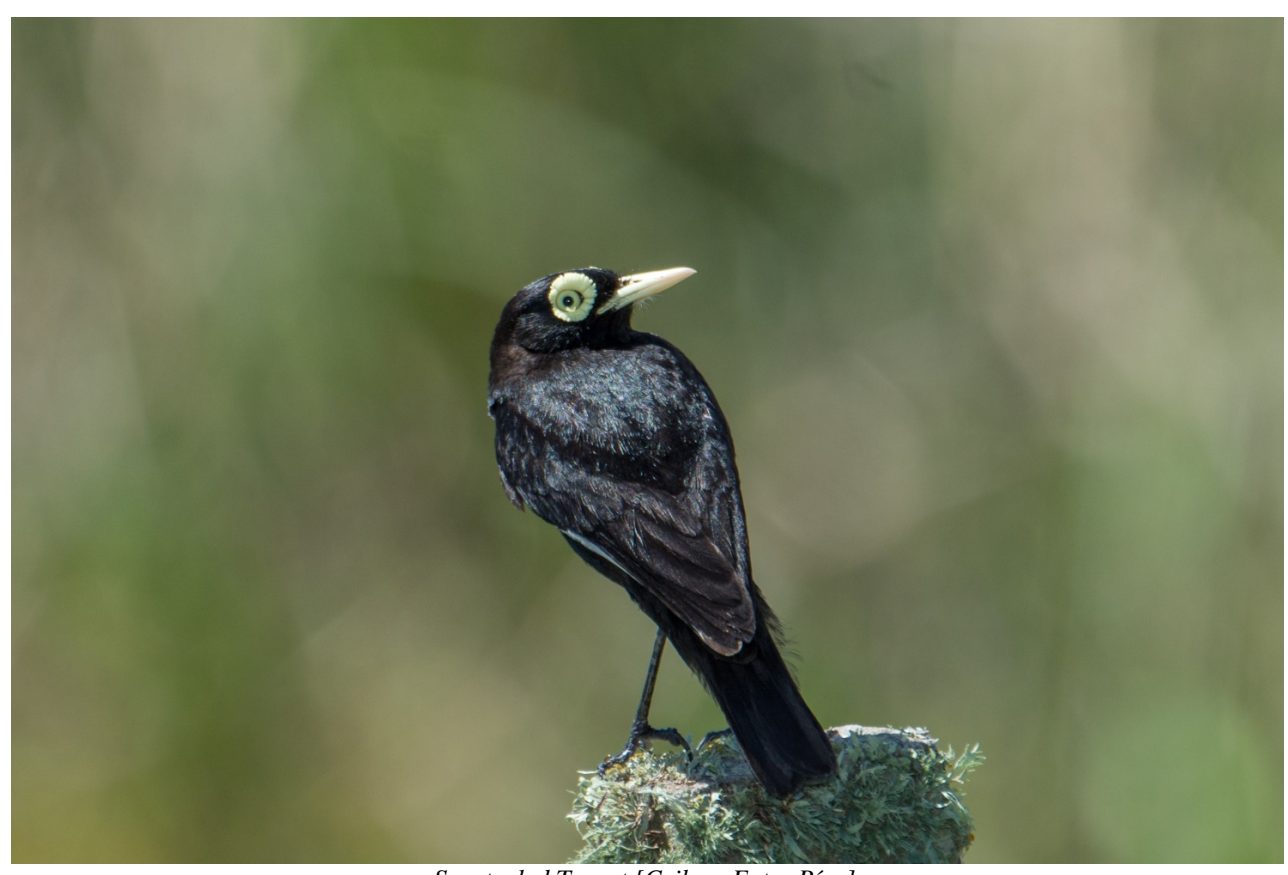
Spectacled Tyrant [Ceibas, Entre Ríos]