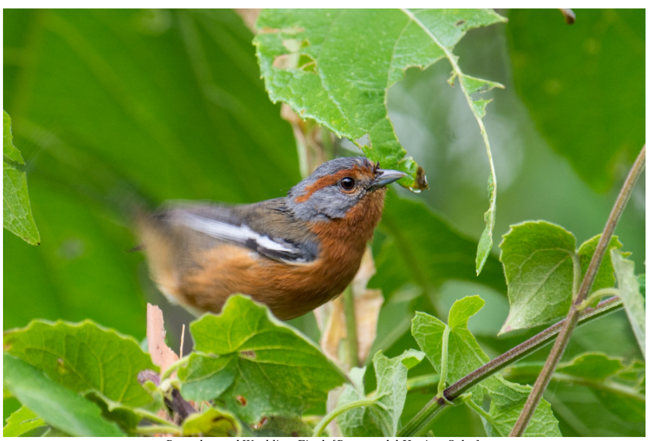
Rusty-browed Warbling-Finch [Reserva del Huaico, Salta]