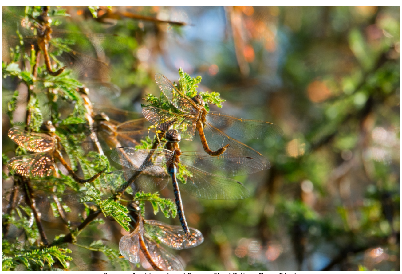
Swarm of golden-winged Dragonflies [Ceibas, Entre Ríos]