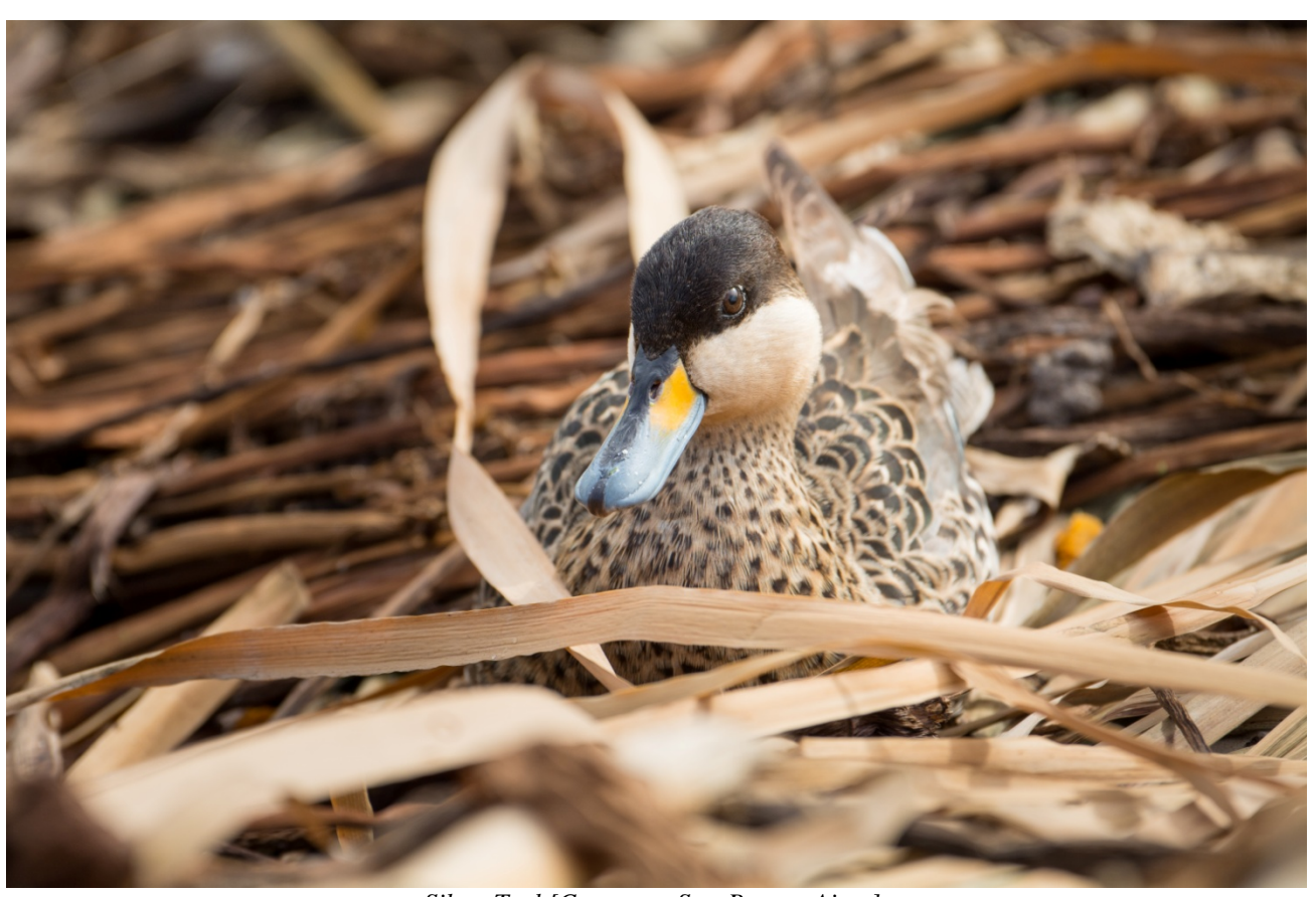
Silver Teal [Costanera Sur, Buenos Aires]