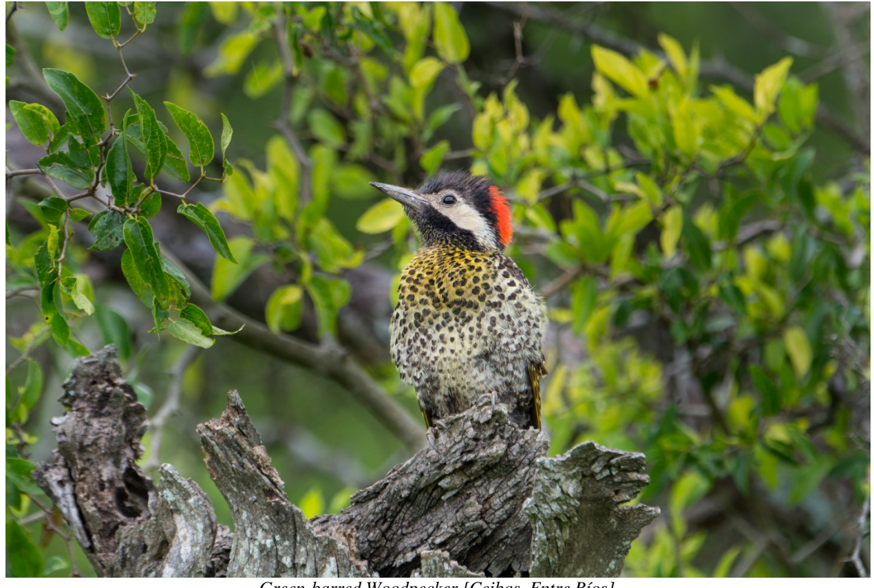
Green-barred Woodpecker [Ceibas, Entre Ríos]