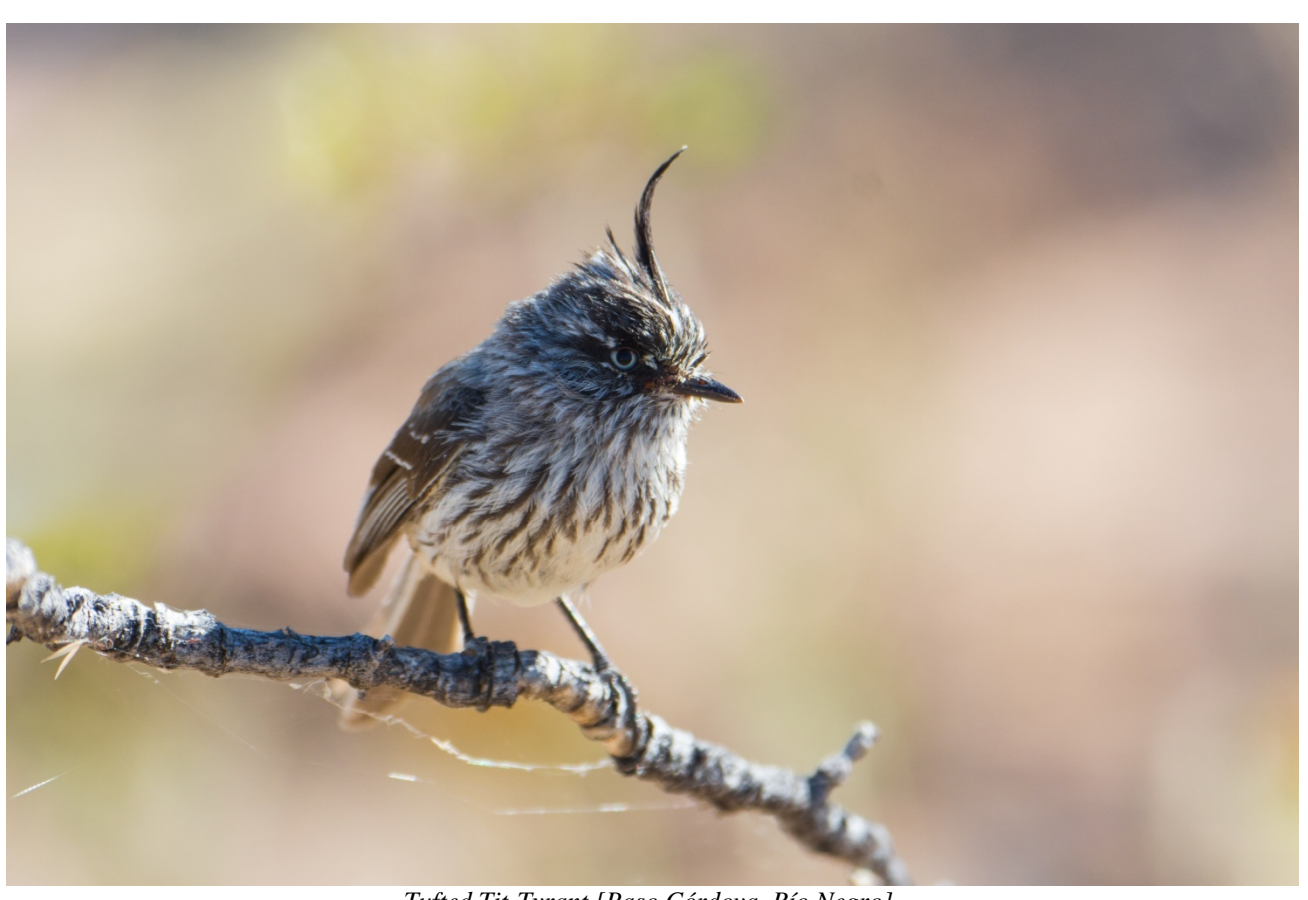
Tufted Tit-Tyrant [Paso Córdova, Río Negro]