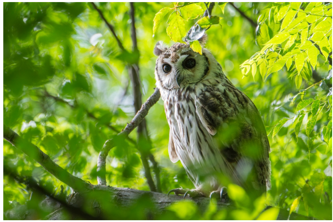
Striped Owl [Costanera Sur, Buenos Aires]

Burrowing Parakeets nesting in the wall of a dry creek bed. It was also an interesting opportunity to learn more about the desert ecology, including the chanar tree ( Geoffroea decorticans ) with its green, photosynthesising bark. Of the 36 bird species identified during the morning, 18 were lifers. I also saw one additional lifer (Black-necked Swan, over a hundred in total) whilst travelling past a dam on the Río Neuquén.