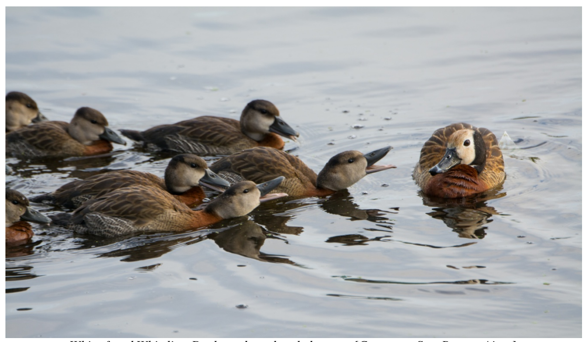
White-faced Whistling-Ducks and one hassled parent [Costanera Sur, Buenos Aires]