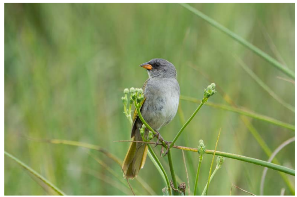
Great Pampa-Finch [Ceibas, Entre Ríos]