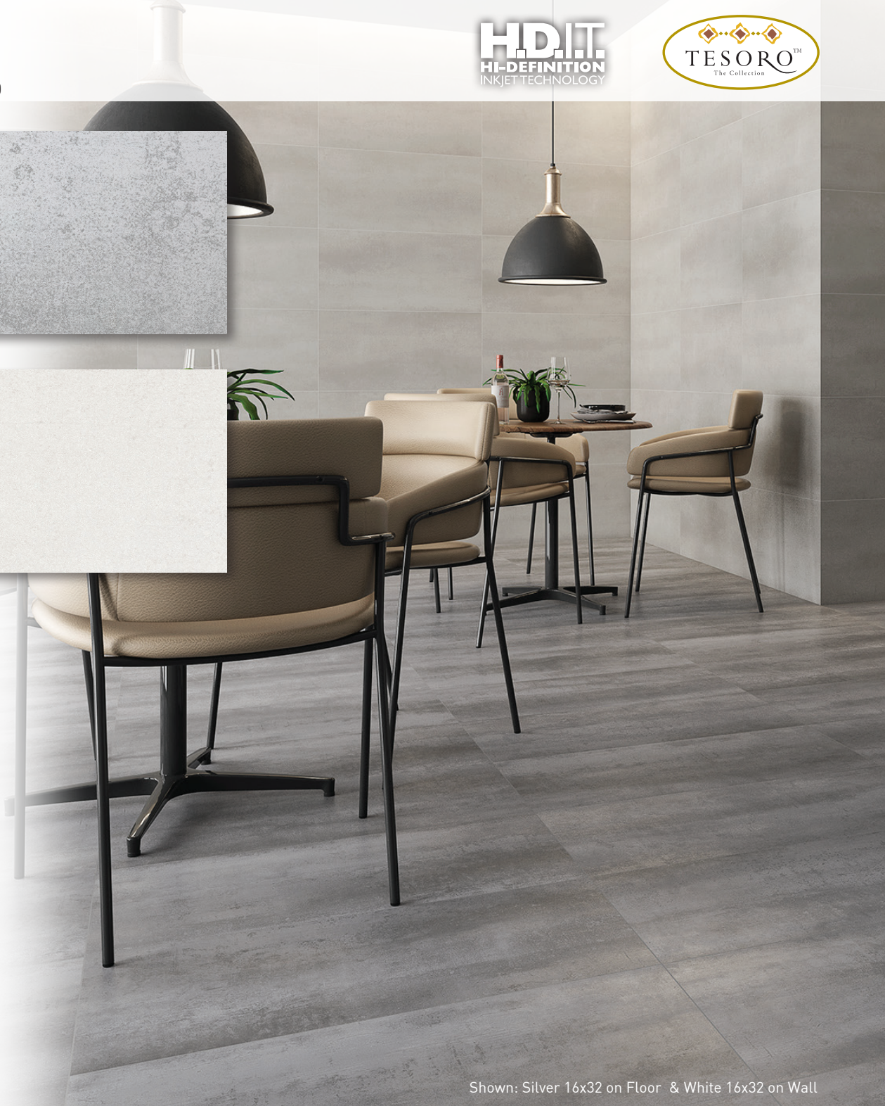
Shown: Silver 16x32 on Floor & White 16x32 on Wall