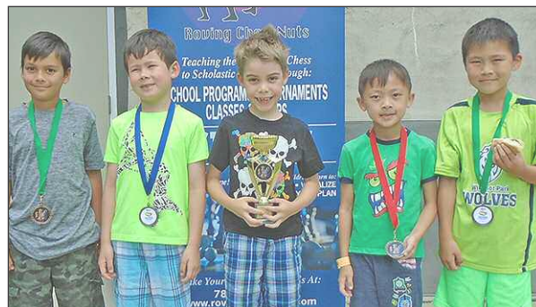
Is that a hotdog that got snuck into the photo of the Section G players?