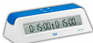
Clocks make for fairer games!

These will be happening during July and August around the city in parks and other places on weekday evenings and weekend mornings. If you want to get involved, email rovingchessnuts@shaw.ca and we'll send you an advance notice besides posting it on www.rovingchessnuts.com Rated Games/FREE