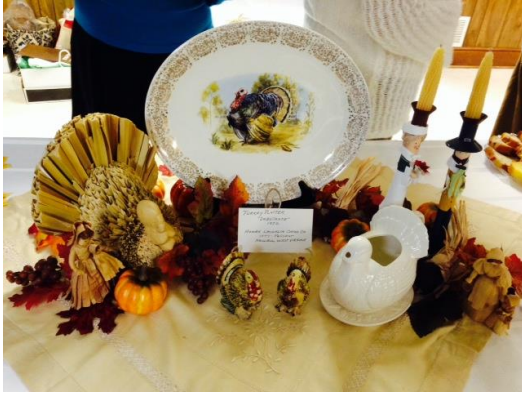
The turkey table setting on our refreshment table was the perfect complement to the November meeting.