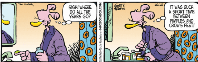
Our 50 went really fast!