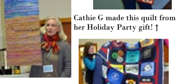
Elena S made this landscape from sari silk strips.↑