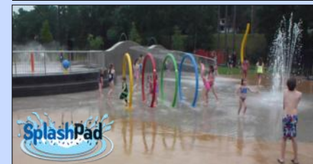
Splash Pad Tuesday & Thursday!