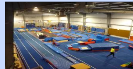
Our 10,000 ft Gym is Air Conditioned!

Read inside about Gymmies amazing new director & free summer trial classes!