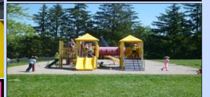
Park Play Every Day!