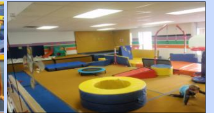
Gymmies Tot Lot Room is self contained Perfect for Gymmies Tot Sprout Camp!