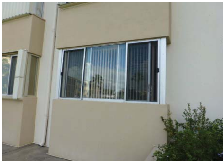
WINDOWS ARE NOT PROTECTED