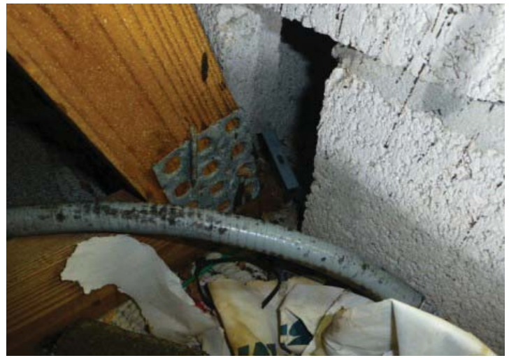
#4 ROOF TO WALL ATTACHMENT OPPOSITE SIDE