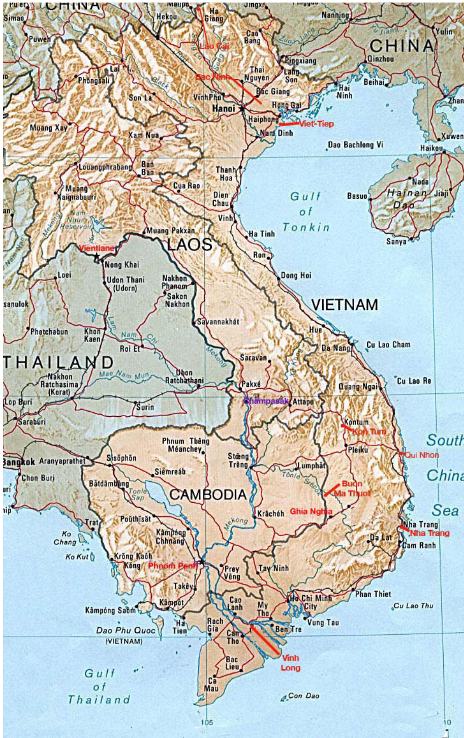
GMV hospital programs established in cities indicated in red