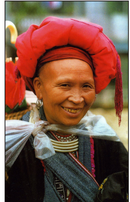
Mountain Tribes Woman In Northern VN