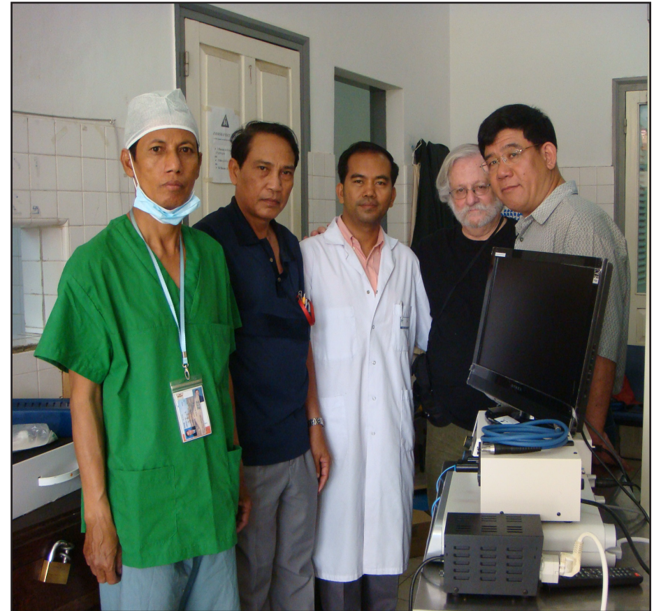
Surgical Equipment Donated to Hospital In Phnom Penh