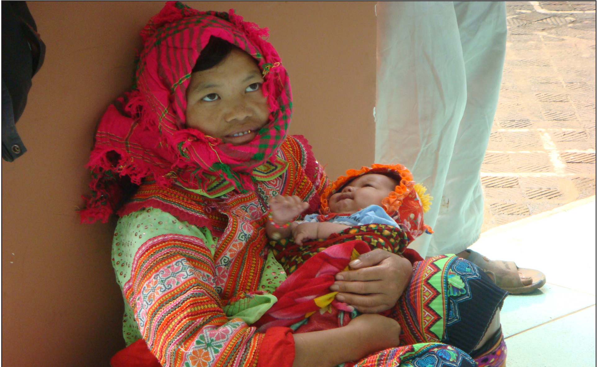
Ethnic Minority Woman With Her Child At Hospital In Ghia Nghia, Central Highlands, VN

In Vientiane, Laos once again, we met with doctors of multiple hospitals and their staff where we found them to be extremely knowledgeable and competent, but once again, their surgical equipment was inadequate or non-functional for the treatment of urological and gastroenterological disease. I performed multiple surgeries with the chief of urology and had promised to furnish him with the appropriate equipment.