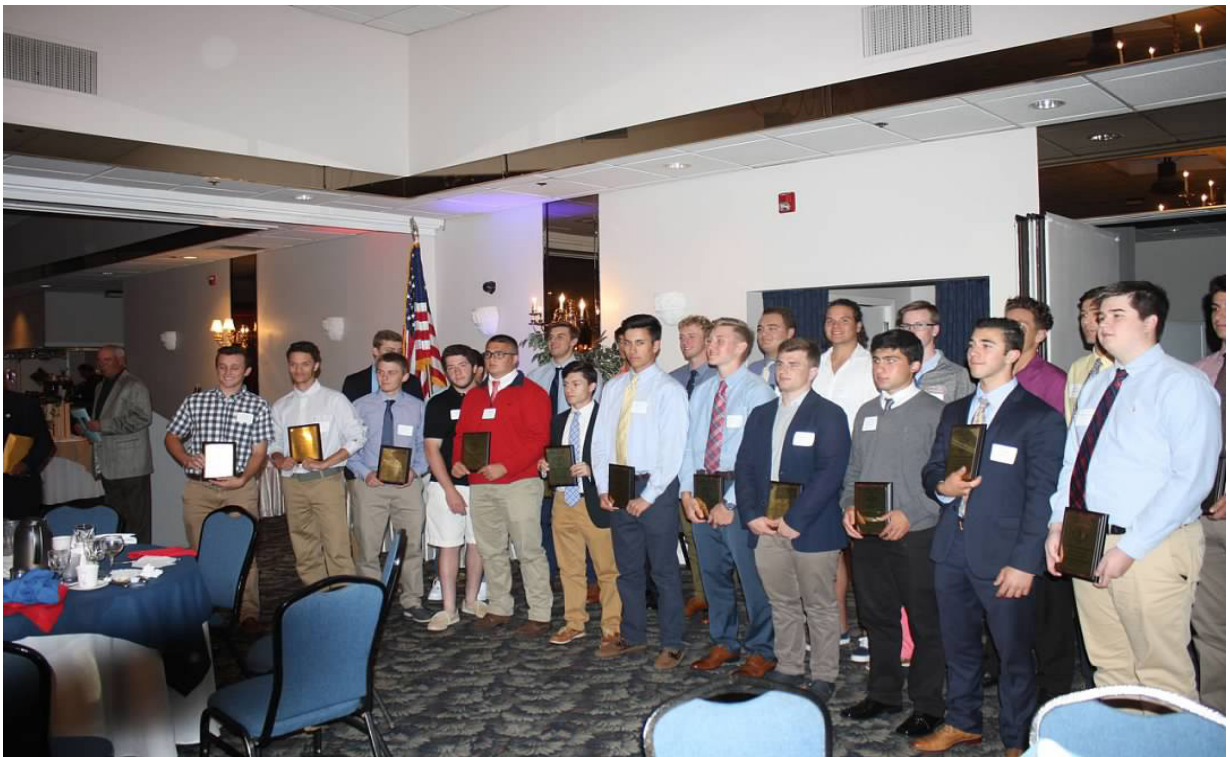
NO I IN TEAM BANQUET - JUNE, 2019