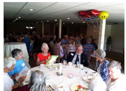
A TABLE OF MEMBERS ENJOYING THE FESTIVITIES