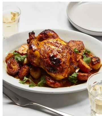
Cornish Hen, Oven Roasted Potatoes