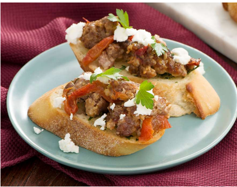
Garlic Toast, Sausage, Goat Cheese