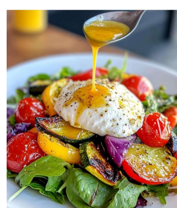
Roasted Vegetable Burrata Salad