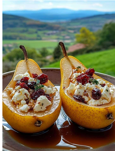
Baked Pears, Feta, Cranberries