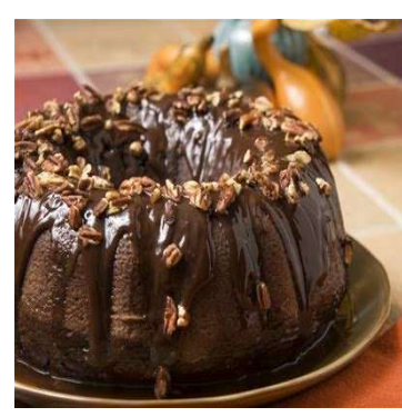
Chocolate Pecan Kahlua Cake