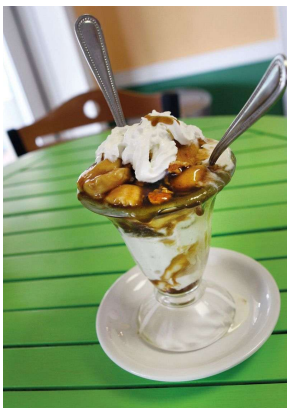
Banana Fosters Sundae