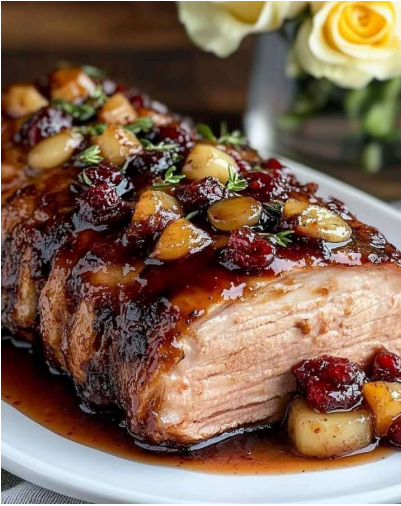
Cranberry Dijon Pork Loin