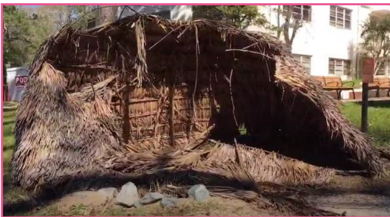
Woodland-period house at Ocmulgee vandalized during the government shutdown.

When employees reported back to work at the end of January, Ocmulgee National Monument staff arrived to a shock. During the first week of the shutdown, a